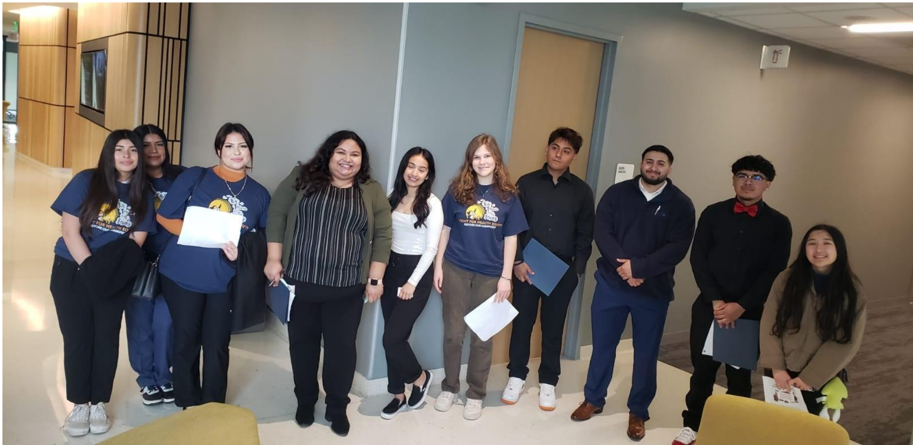
Pioneer Valley High School and Dos Pueblos High School FACT members attended The Youth Quest Advocacy Teen Conference in Sacramento. During the conference students prepared to meet with legislators to advocate for the Tobacco Endgame as well as shared how tobacco, vaping, and vaping cannabis is impacting their schools and peers.