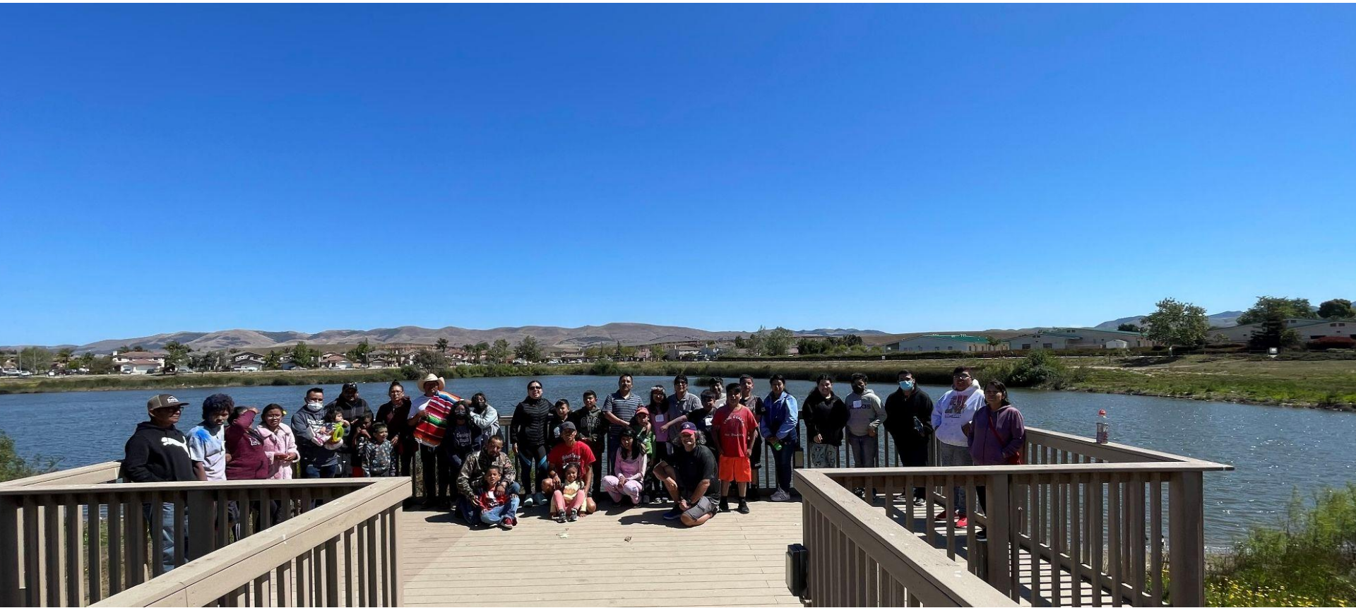
Family Engagement 5k Color Run at Jim May Park