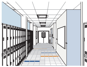
3D_Interior Hallway_Second Floor