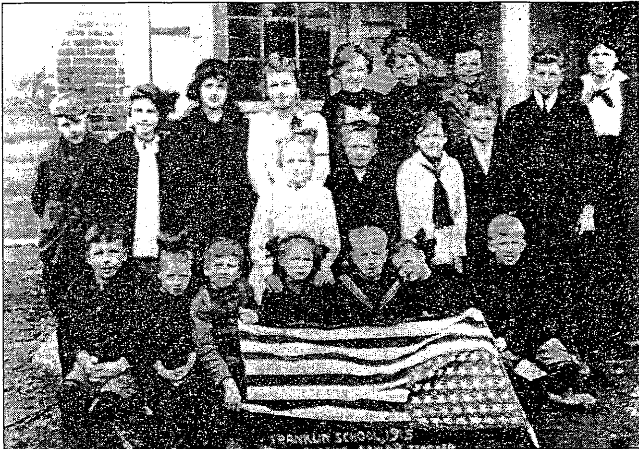
The Franklin School, Class of 1915.