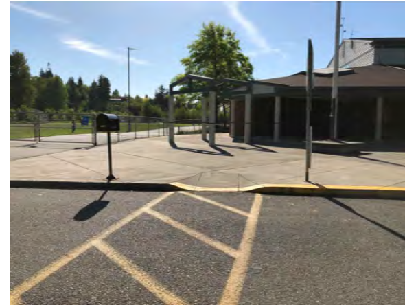
To get onto the sidewalk use the curb cut. Note that this curb cut does not meet ADA standards.