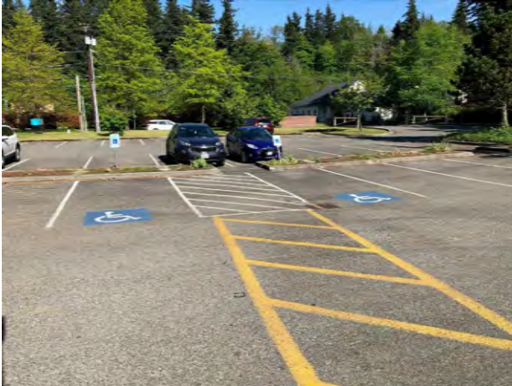
ADA stalls in parking lot. Crosswalk does lead to a curb cut.