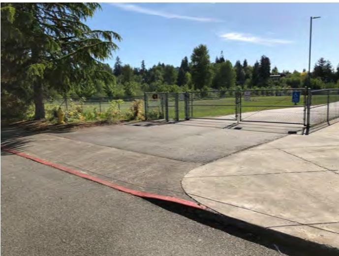
To get to the field, go through the vehicle gate. This gate is locked at most times. A key may be obtained from Security. To reach the main office use the main building entrance to the right of the vehicle gate.