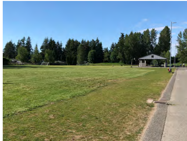
Continue through the vehicle gate and keep to the left for field access.