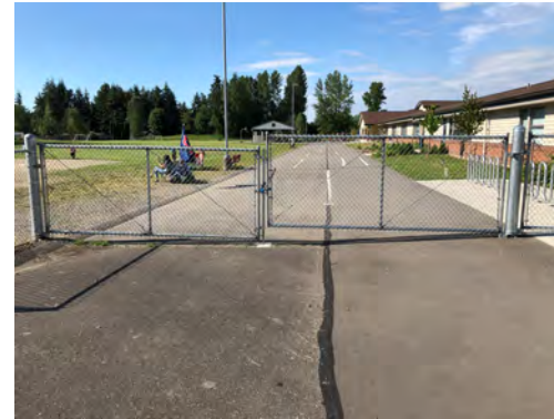
For field access, head to the north west corner of the parking lot, and go through the vehicle gates. These gates are locked during certain hours. A key may be obtained from Security.