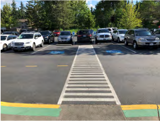
From main ADA stalls in parking lot, continue over the crosswalk, up the curb cut, and north on the sidewalk to the front doors for building access.