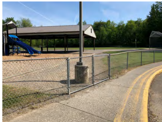
Follow the sidewalk south and enter through the gate for field access.