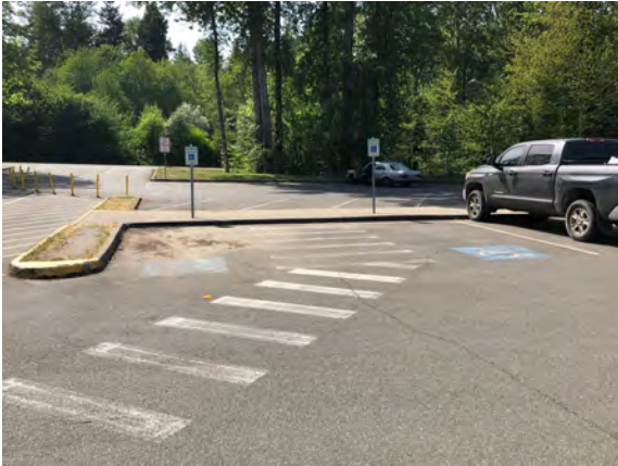
ADA stalls at Fruitland. Note that the crosswalk leads to a curb cut with an asphalt transition. This does not meet all ADA standards. For field access, continue south on the sidewalk.