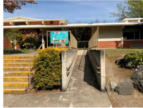
For building access continue up the ramp on the west side of the building, closest to the parking lot. This will lead you to the main entrance.