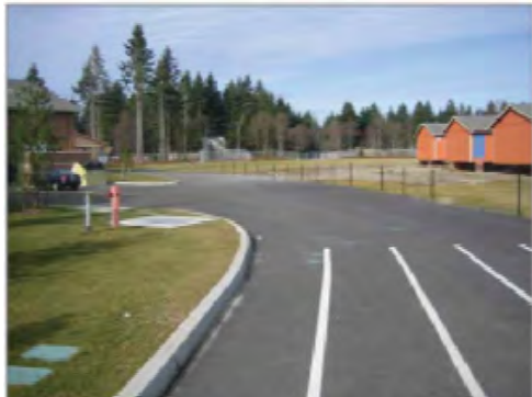
To get to field from ADA stalls, go across the concrete (picture 1) onto sidewalk. Follow sidewalk around the building until it ends (picture 2). Proceed down pavement to fields.