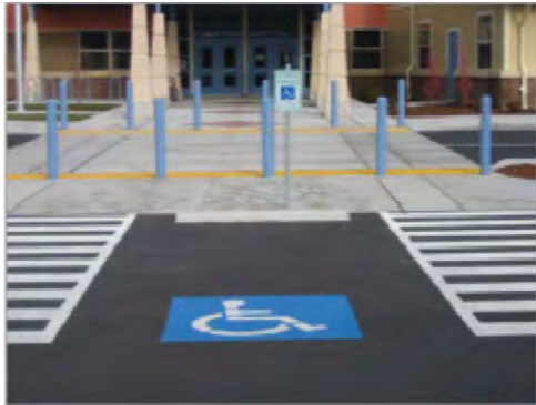
To get to main building from ADA stalls, go across the concrete into the building.