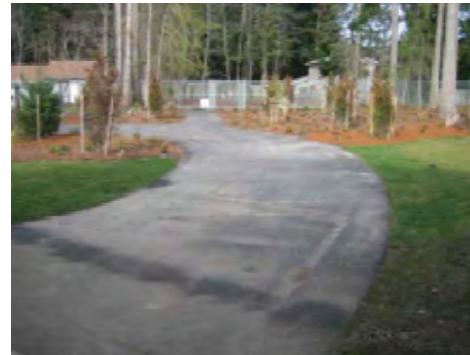
Alternate entry to fields from 164th St E. Enter through gate and follow pavement to fields.