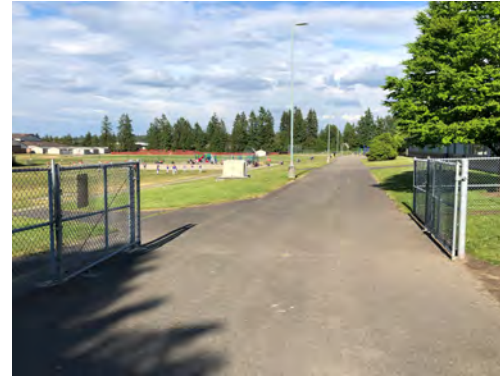
To get to the field, continue through the vehicle gate. This gate is locked at most times. A key may be obtained from Security.