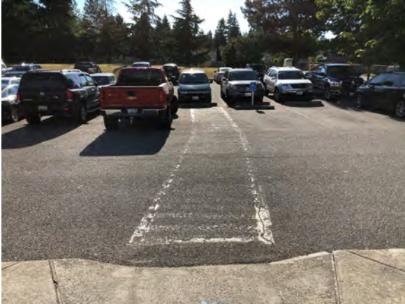
Main ADA stalls in parking lot. Note that the crosswalk leads to a curb cut which does not meet all ADA standards. For building access, continue up the sidewalk to the main entrance.