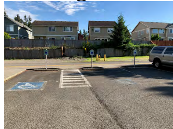
Additional parking at south end of parking lot. Note that the curb cuts to the sidewalk do not meet all ADA standards.