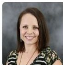
Dr. Moore Parmley Elementary