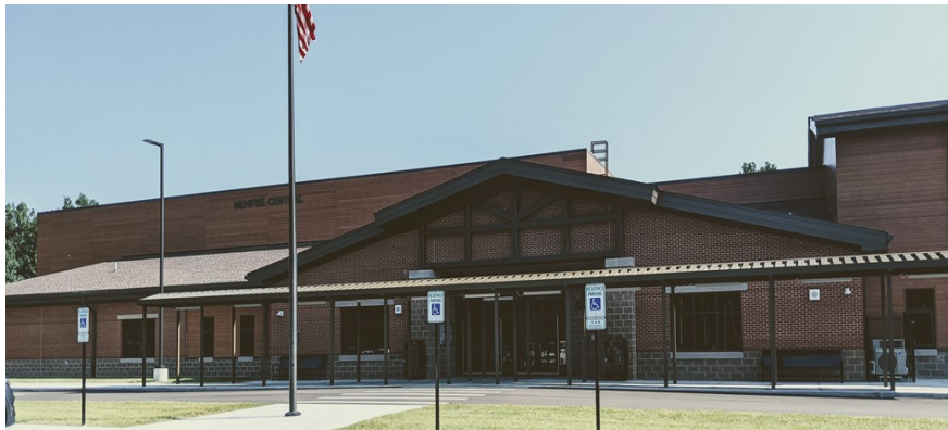
Menifee Central 359 Wynn Flat Rd. Wellington, KY 40322 (606) 768-4102