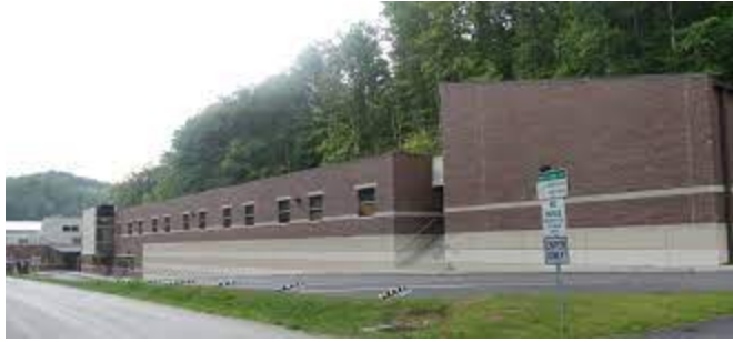
Menifee County High School 119 Indian Creek Road Frenchburg, KY 40322 (606) 768-8102