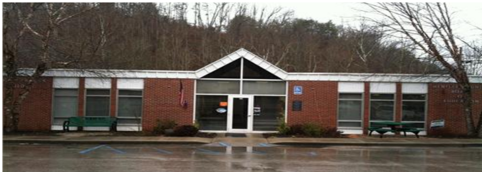
Menifee County Board of Education 202 Back Street PO Box 110 Frenchburg, KY 40322 (606) 768-8001