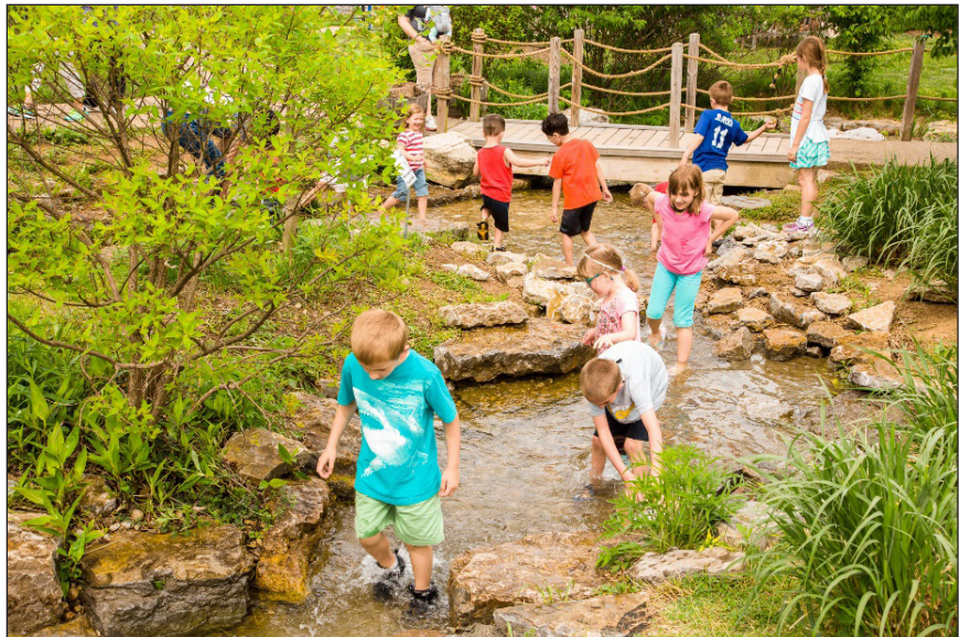
Outdoor classrooms involving youth often have elements of play to encourage young learners to explore their environment.

Get Buy-in. Creating an outdoor classroom is not a one-person show. You will need help and cooperation from others in your organization, such as your supervisor or principal, fellow educators, and grounds personnel. It's best to seek this type of input early in the process. Be ready to explain your proposed vision, goals, and objectives for the project.