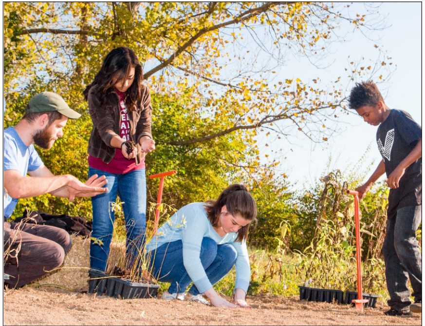
Whenever possible, use native plants in your project.

Planting. The time of year is a factor for planting trees, shrubs, and other plants. Trees are best planted in the late fall and early spring while flowering plants should be planted after the last frost. When selecting vegetation, consider what plants are available locally, whether the area will have standing water and, if so, for how long, the amount of sunlight the area receives, the hardiness of plants with respect to human traffic, and the level of required maintenance. Select and use native plants.