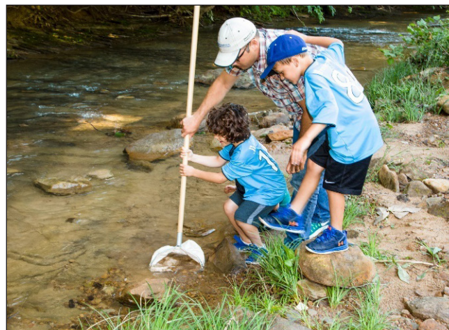
Outdoor classrooms can involve a planned layout, such as that of the Children's Garden at The Arboretum in Lexington, KY (left), or a natural layout, such as a stream (right).