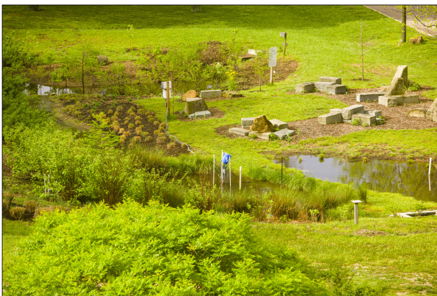
This rain garden, on the University of Kentucky campus, provides students with opportunities to study and research many topics related to water, soils, and plants.

An outdoor classroom can be as simple as a stream, woods, or patch of soil. Even a parking lot can serve as an outdoor classroom. In other words, you can create an outdoor learning environment without construction or expense. However, an outdoor classroom often involves a space with a carefully planned layout, much like that of an indoor classroom. Outdoor classrooms provide many benefits and can serve as important resources for teachers, 4-H Youth Development agents, and other educators.