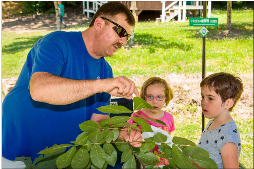
Materials from forests or woods are excellent instructional materials to teach learners of all ages about trees.

Because resources are limited, it is important that you PRIORITIZE your goals. Decide which goals are the most important for achieving your vision and work on those first. As additional resources become available, move on to lower priority goals. Once assembled, your team will help you refine the goals of the project along with their prioritization.