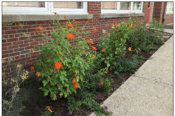
An outdoor classroom can include many kinds of gardens, plants, and structures.