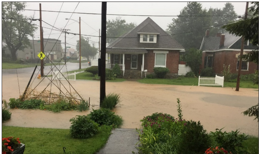
Installing erosion control measures, such as straw and mulch, is a critical yet often overlooked aspect of constructing an outdoor classroom (top). If left unprotected, rainfall will easily erode bare soil, which is then transported offsite in the form of runoff (bottom).

Waste is also generated when building the components of the outdoor classroom (e.g., composting bins, rain barrels, raised bed gardens) and when planting.