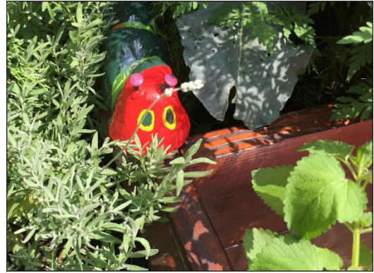
Personalize your outdoor classroom by adding art such as painted fences, butterfly houses, or literary characters.