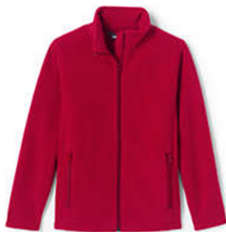
(OPTIONAL) RED FLEECE JACKET WITH LOGO