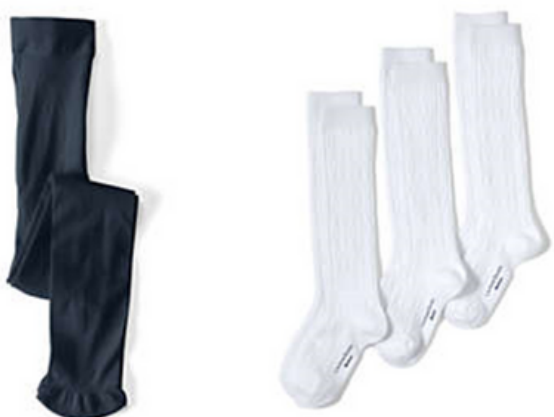
NAVY, RED, WHITE OR BLACK TIGHTS OR SOCKS