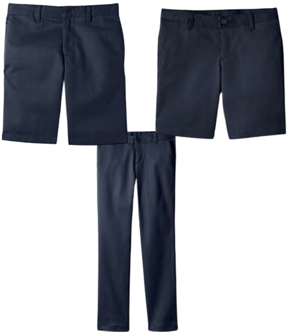
NAVY SHORTS, NAVY PANTS