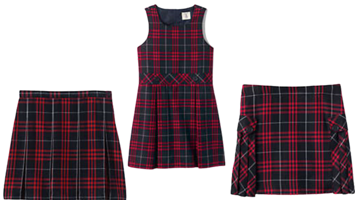
PLAID SKORT, PLAIDSKIRT OR PINAFORE