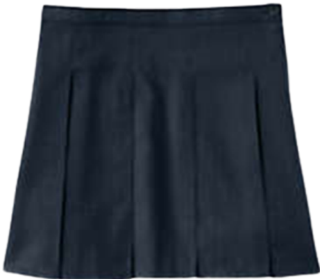
NAVY SKIRT OR SKORT OPTION