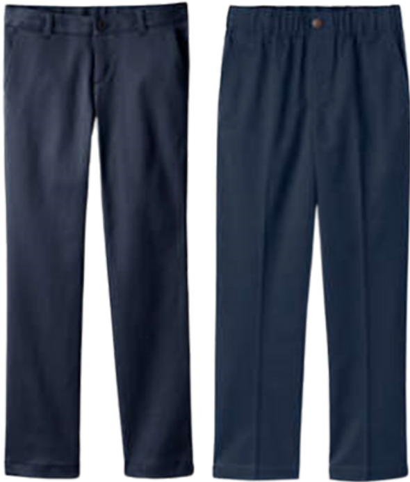
NAVY SKIRT, NAVY PANTS