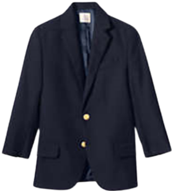
NAVY BLAZER (FOR FORMAL OCCASIONS)