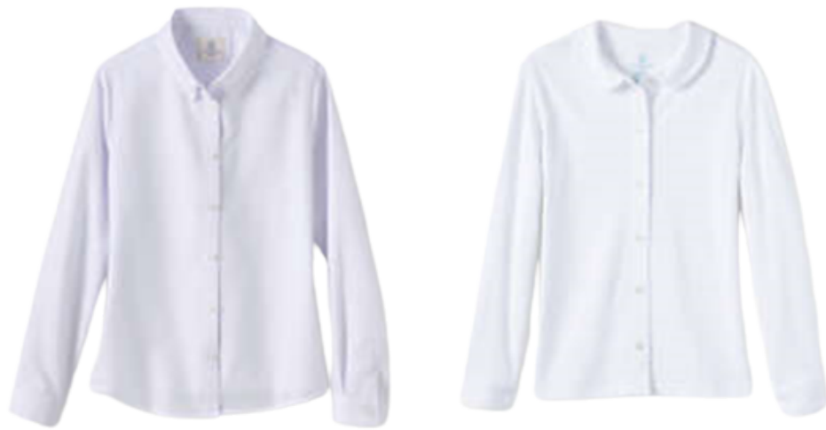
LONG SLEEVE WHITE SHIRT