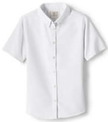
SHORT SLEEVE WHITE SHIRT OPTIONS