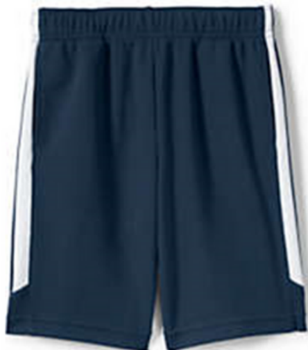
NAVY TRACK JACKET, NAVY TRACK SHORTS OR PANTS