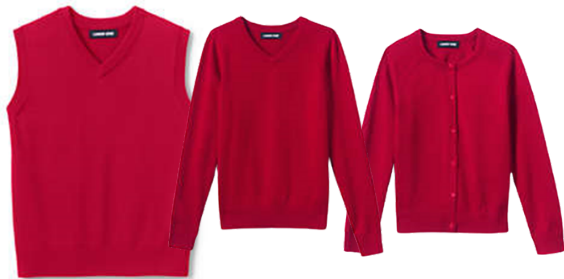
RED CARDIGAN, V-NECK JUMPER, OR VEST (OPTIONAL)