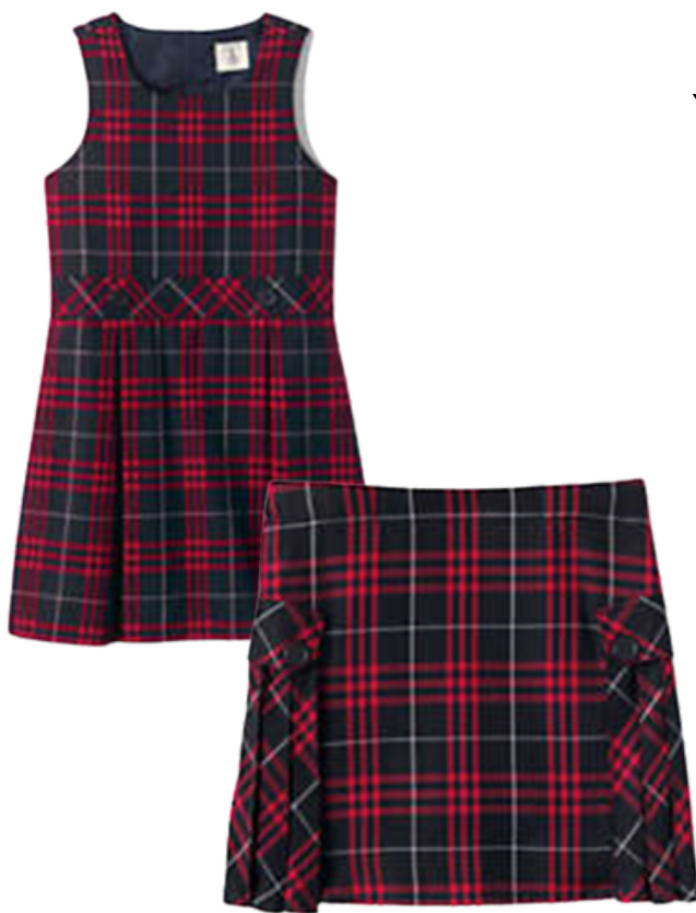
PLAID PINAFORE, PLAID SKORT