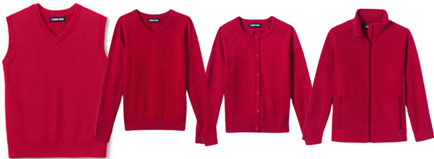
RED CARDIGAN, V-NECK JUMPER, VEST WITH LOGO OPTIONAL (FLEECE WITH LOGO)