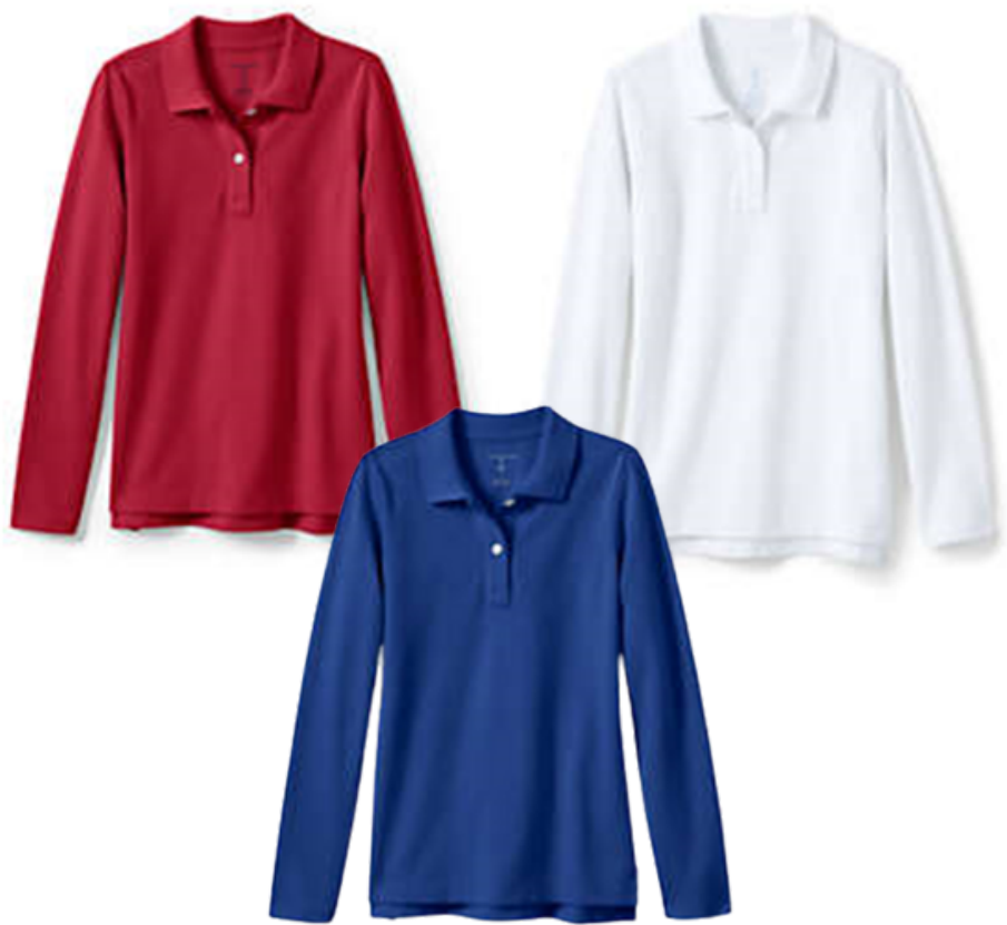
HOUSE COLOR POLO SHIRTS WITH LOGOS (SHORT OR LONG SLEEVED)