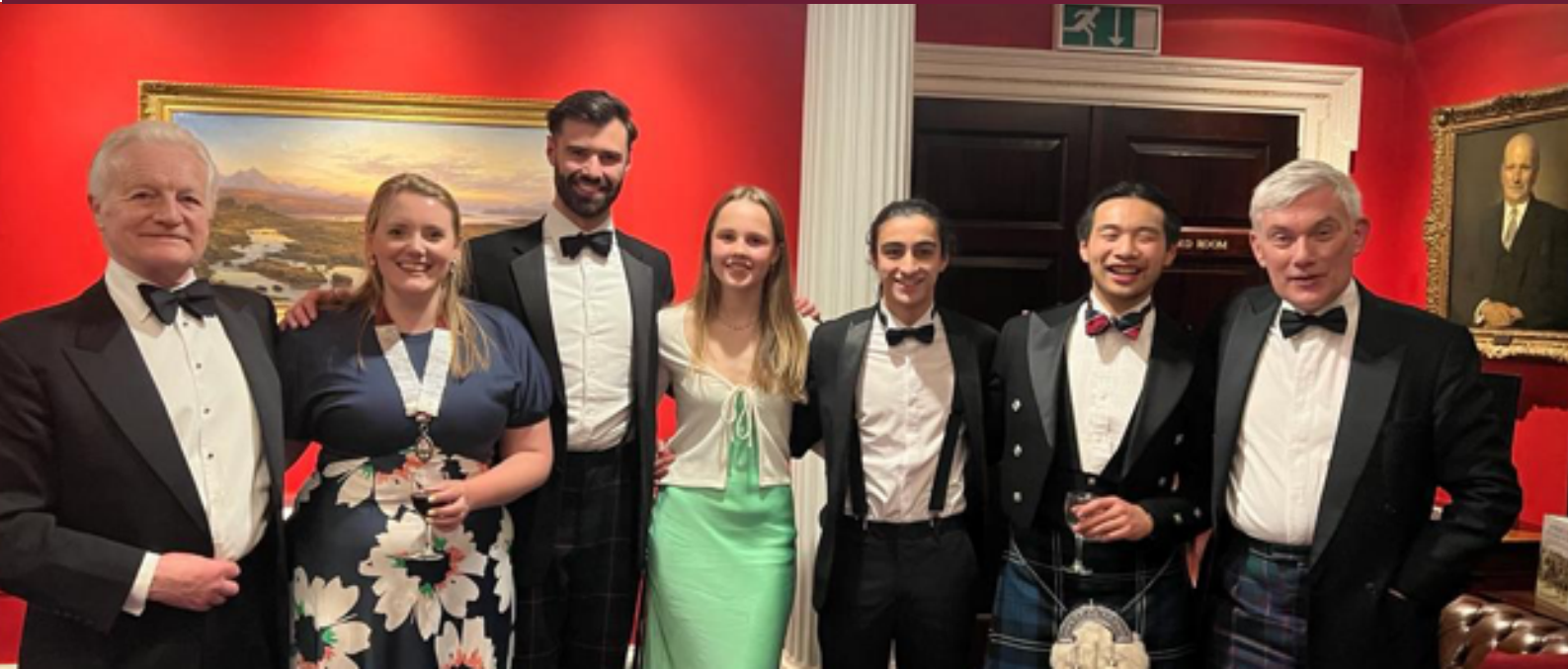
Above: The London Watsonian Club's 111th annual dinner in April 2023. Further Branch highlights on page 2.

Updates and news from our Watsonian community