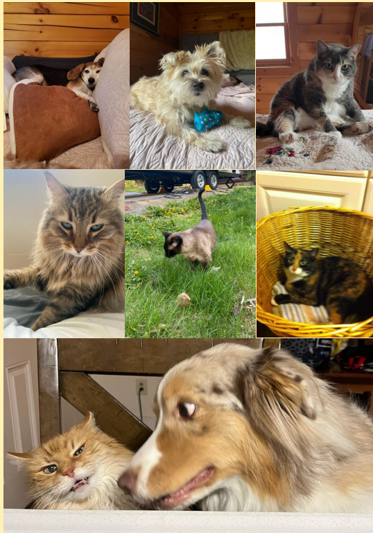
Left to right from the top: Ginger, Bits, Pretty, Trouble, Bernie, Cali, Grandcat Nala and Granddog Bindhi!