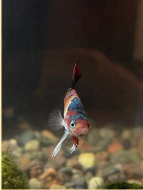
Skyla Aubut's pet fish swimming laps.