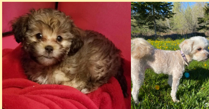
Helena Cochran's puppy changed from brown to white as she got older.