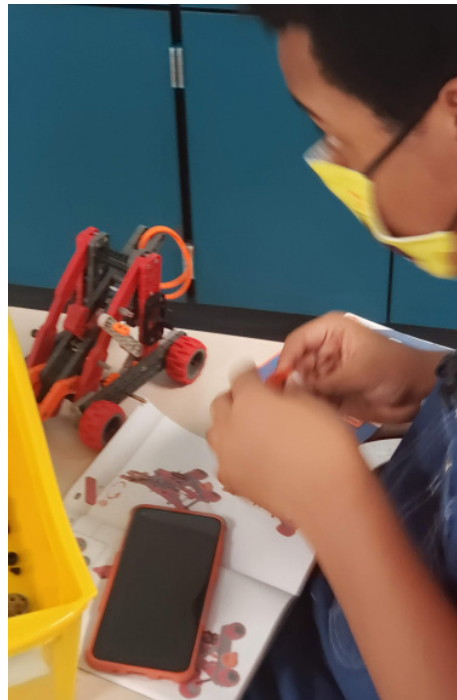
Maker Space Club at Raytown Middle School