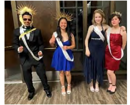
ECA Prom was unbelievable!!!