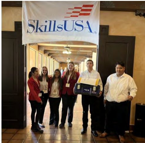
CEC Cosmetology and Automotive SkillsUSA Participants in this year's competition!