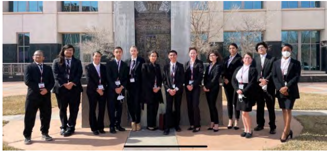
ECA's Mock Trial and Debate Team!!