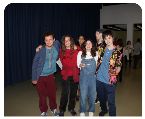
NHS Students at Art Show