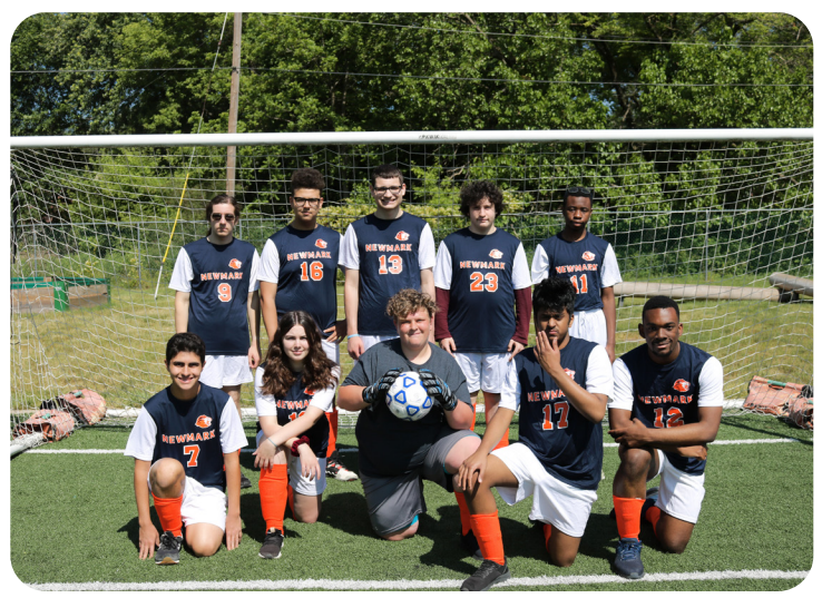
NHS Soccer Team