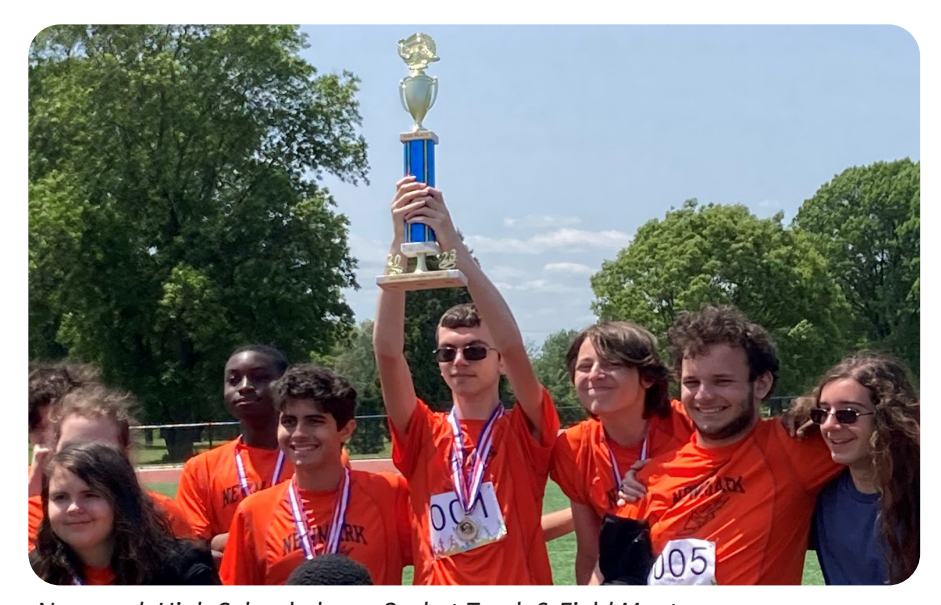
Newmark High School places 2nd at Track & Field Meet