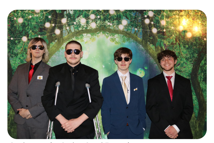
Seniors at the Spring Semi Formal