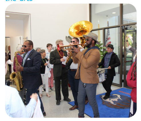
Liftoff Brass Band welcoming guests

If you appreciate the Arts at Newmark, its not too late to be a Newmark Arts Supporter! Visit https://www.newmarkeducation.com/ways-to-give/art-show-2023/support-the-arts