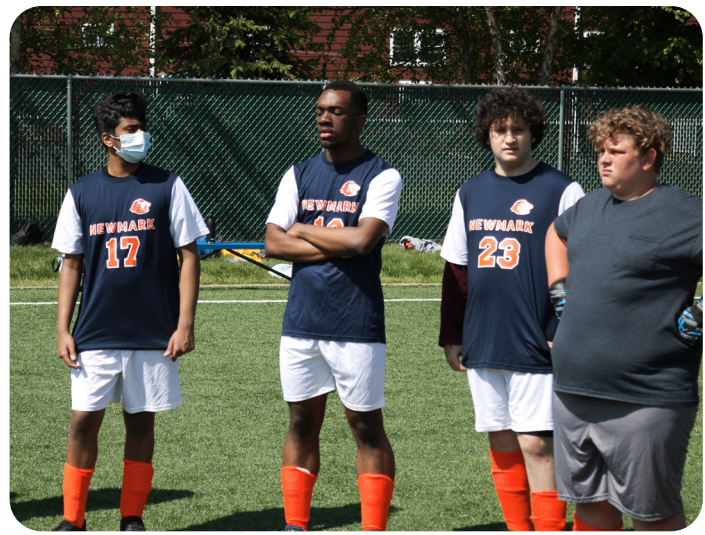
Put me in, coach.