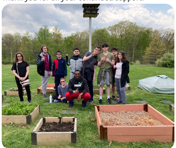
Garden at St. Hubert's Giralda

Thank you for all your continued support!