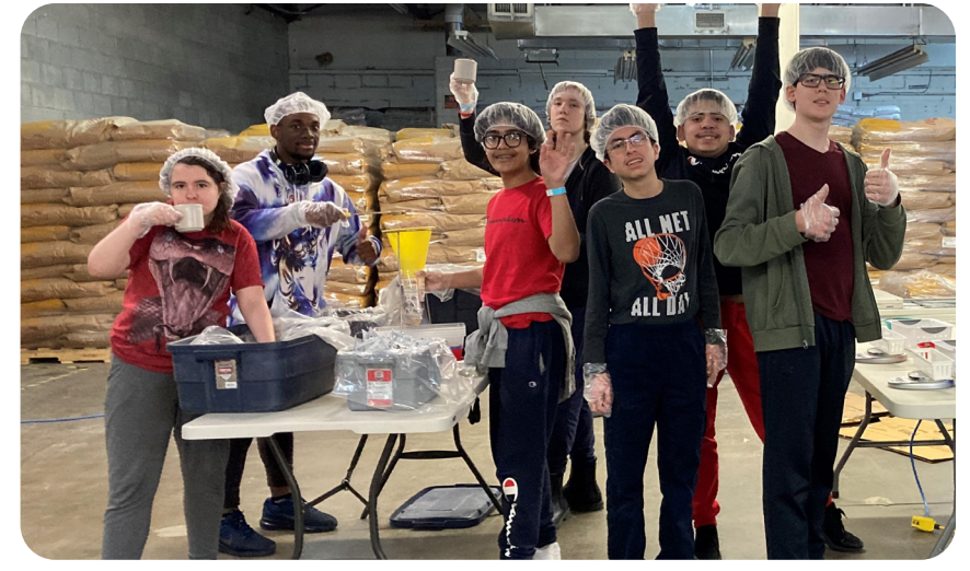
Filling bags of rice for Rise Against Hunger