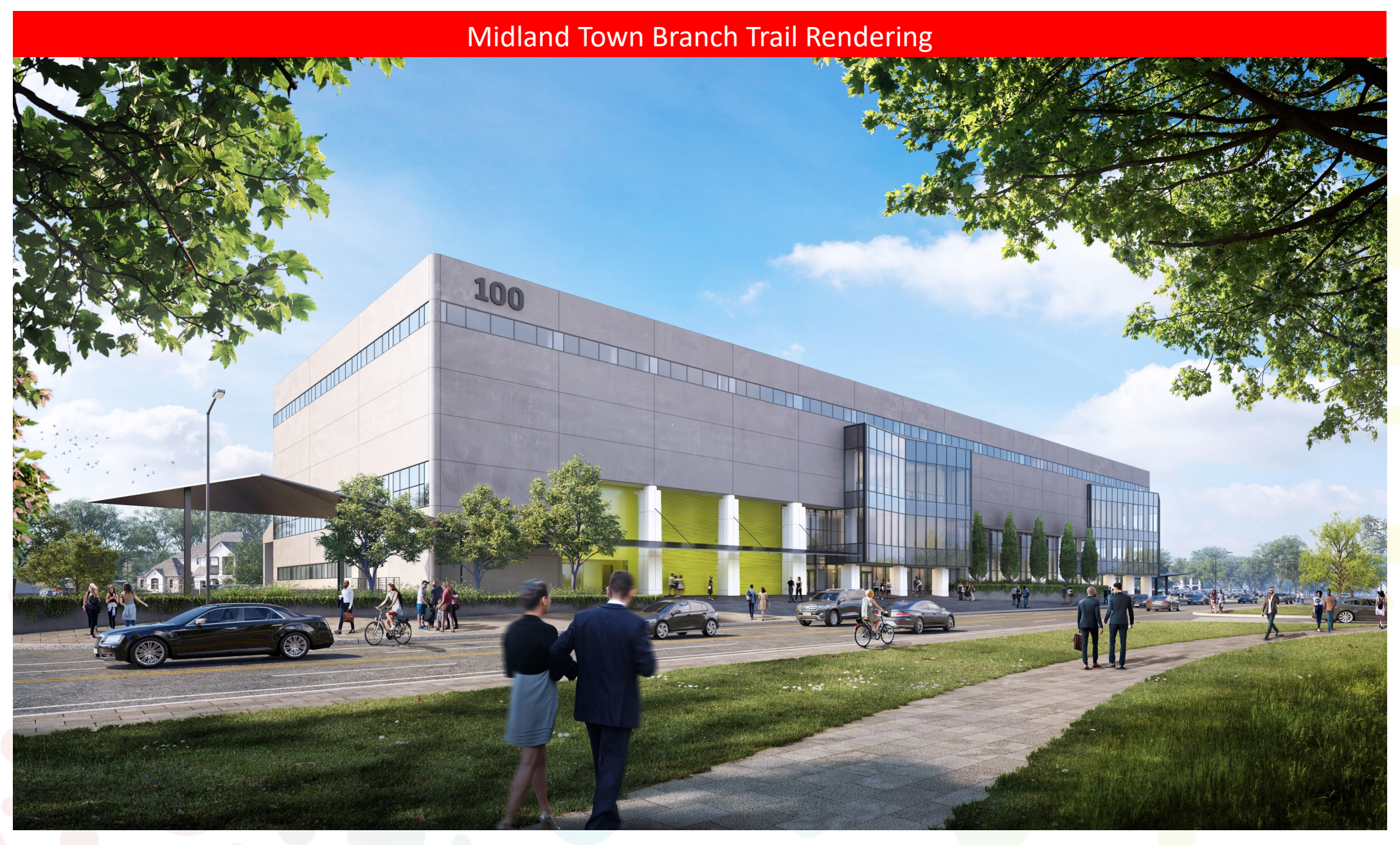
Week Ending June 16, 2023