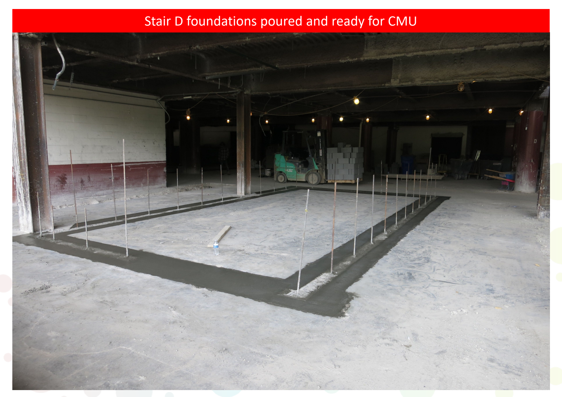
Week Ending June 16, 2023