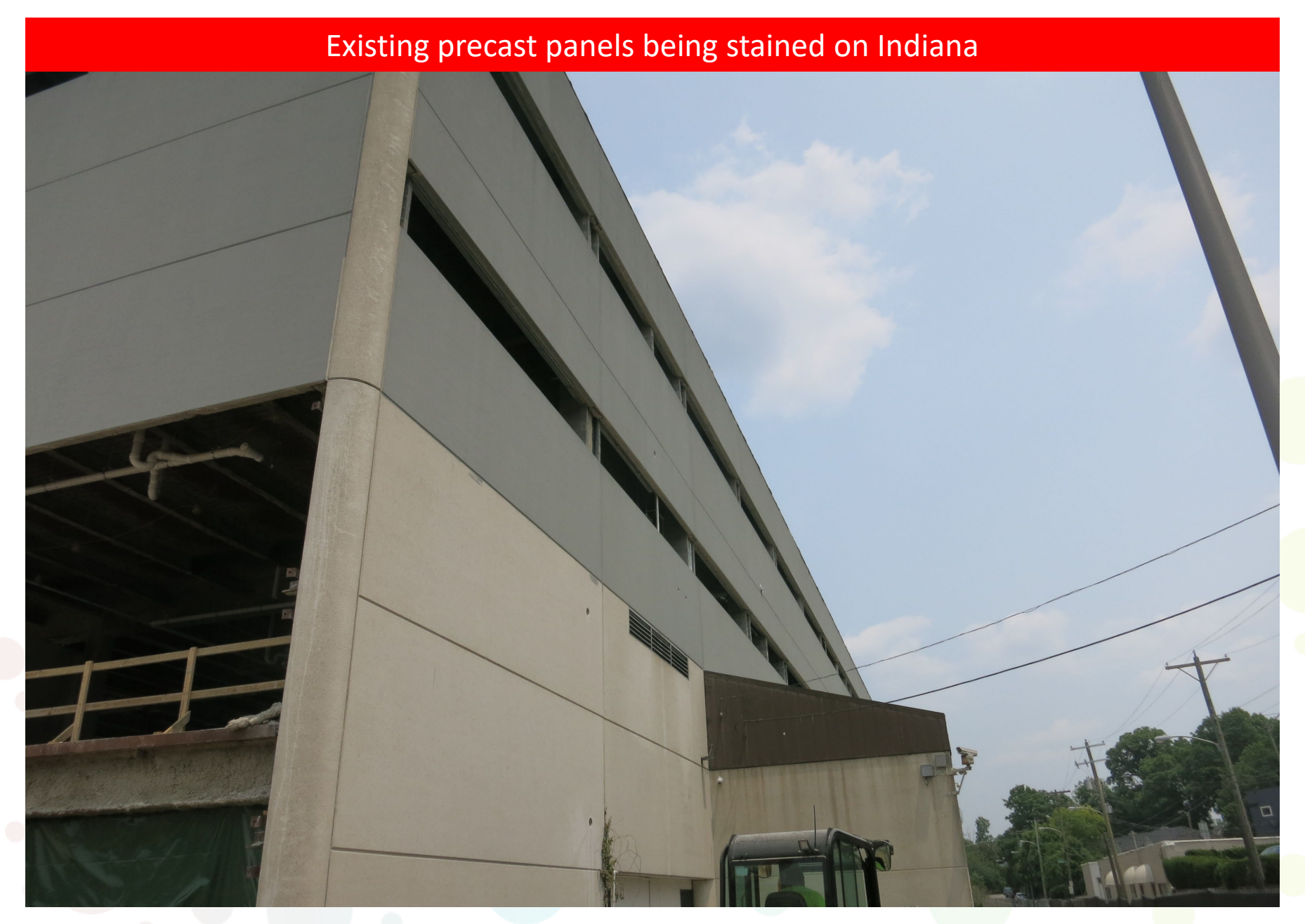
Week Ending June 16, 2023