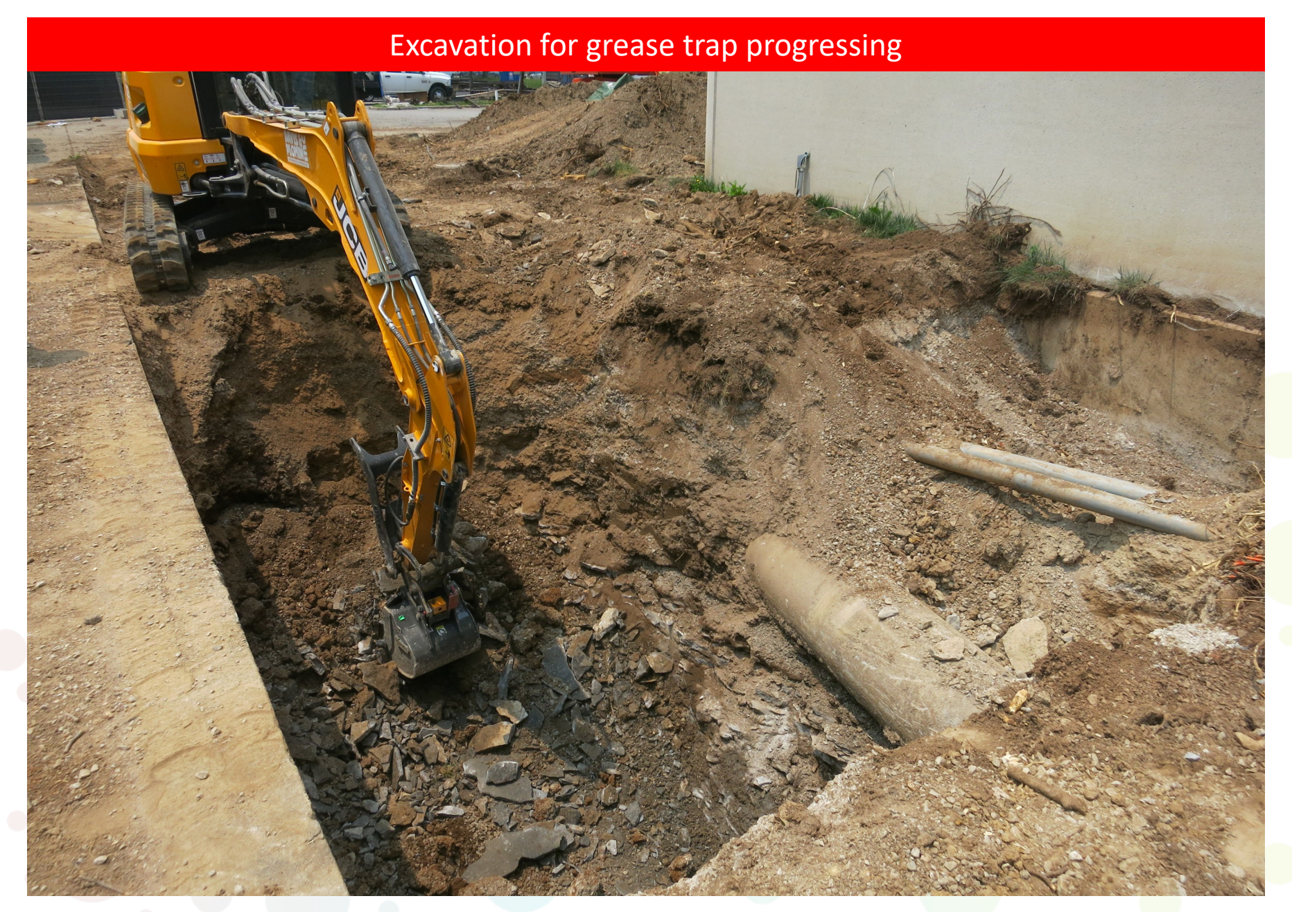
Week Ending June 16, 2023