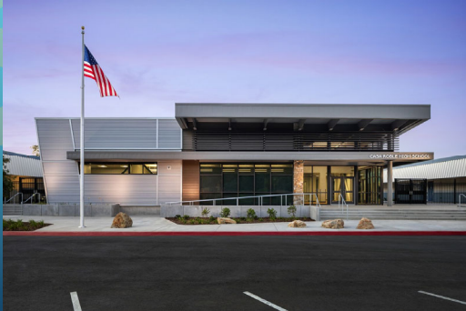
◆ Casa Roble Fundamental HS Student Union