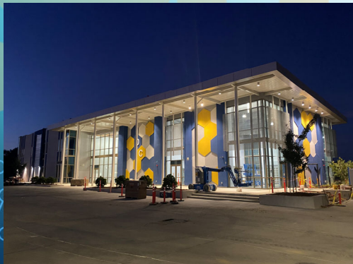
◆ Del Campo High School Science Building