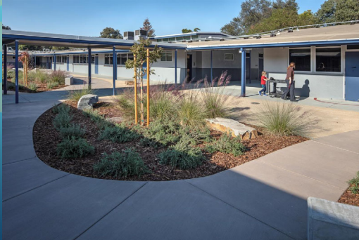
◆ Littlejohn Site (California Montessori)