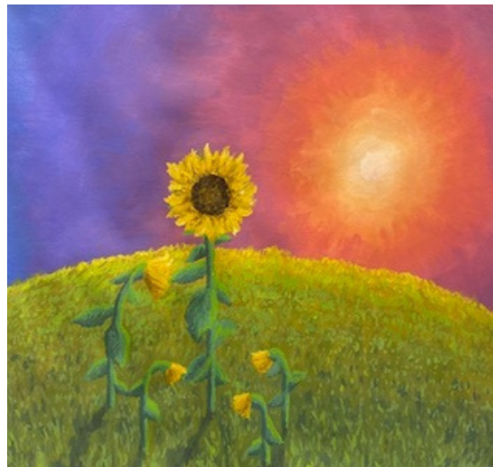
Ian Zotter-Barlow Who is Watching?