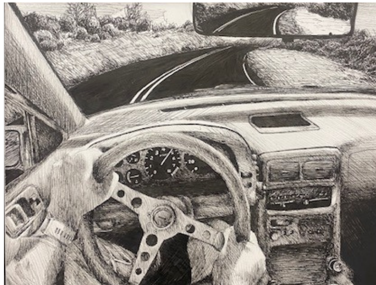
Ethan Soule Escape

This past May, Ms. Van Aken's AP Drawing Portfolio students curated an exhibition of their art for display at MHS.