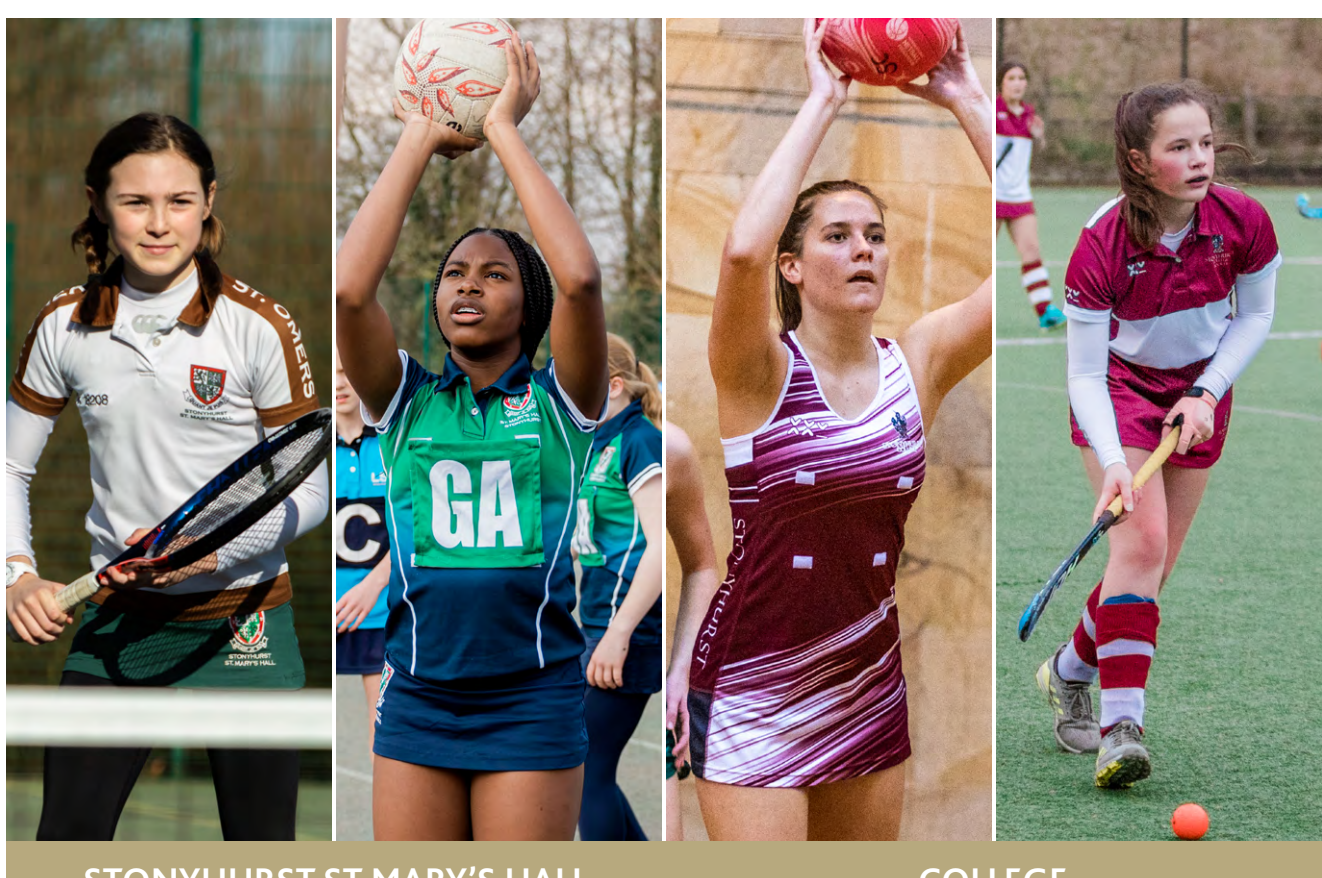
STONYHURST ST MARY'S HALL