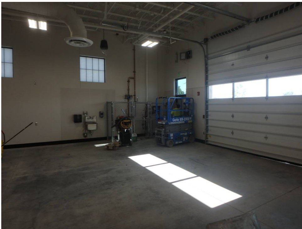
Looking northeast into the shops northeast corner