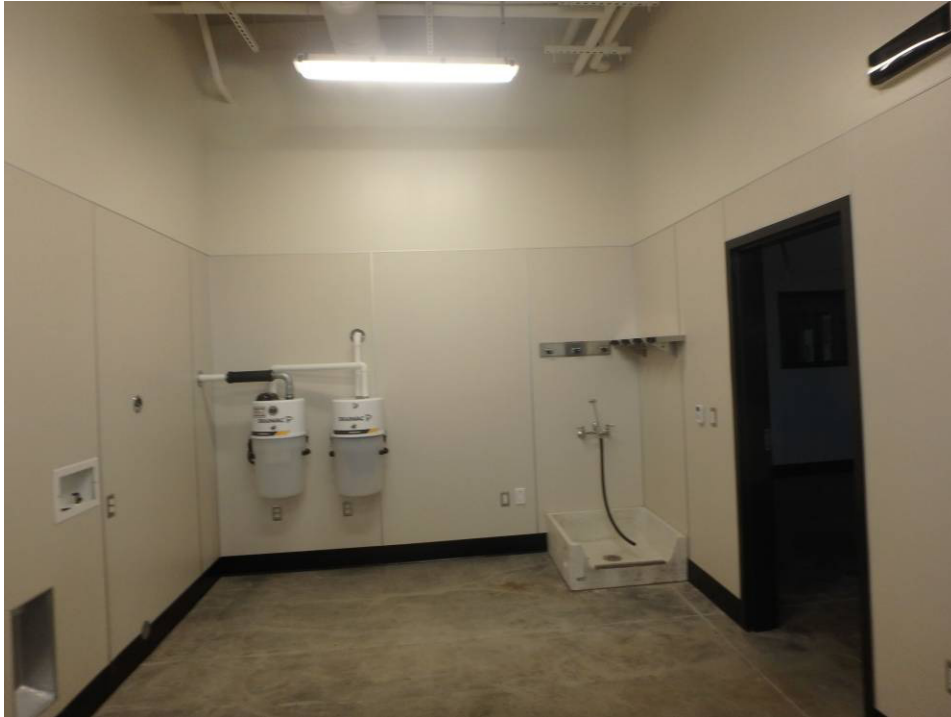
Kennel Room vacuum and sink on the north wall