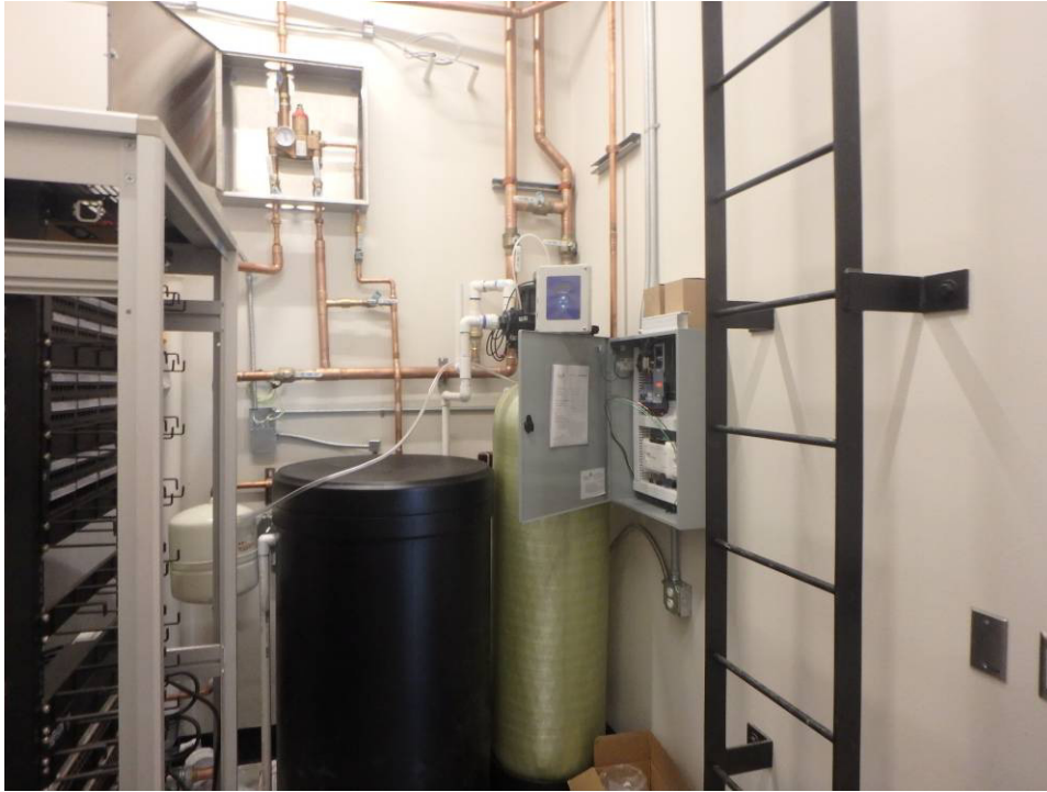
Mechanical room –preparing to sent water softener and brine tank