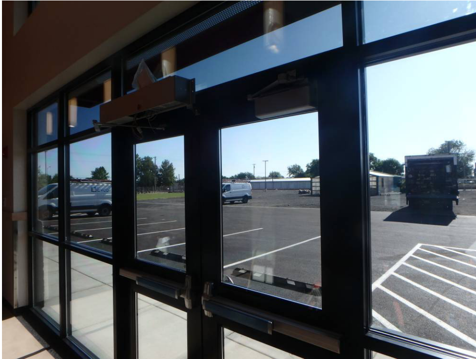
Main entry doors and sidelites