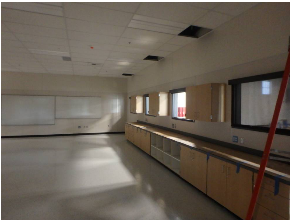
Looking west at the north wall of the north classroom