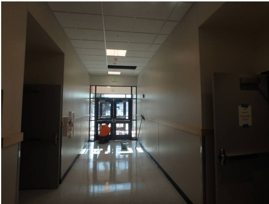
Looking east at the main east-west corridor