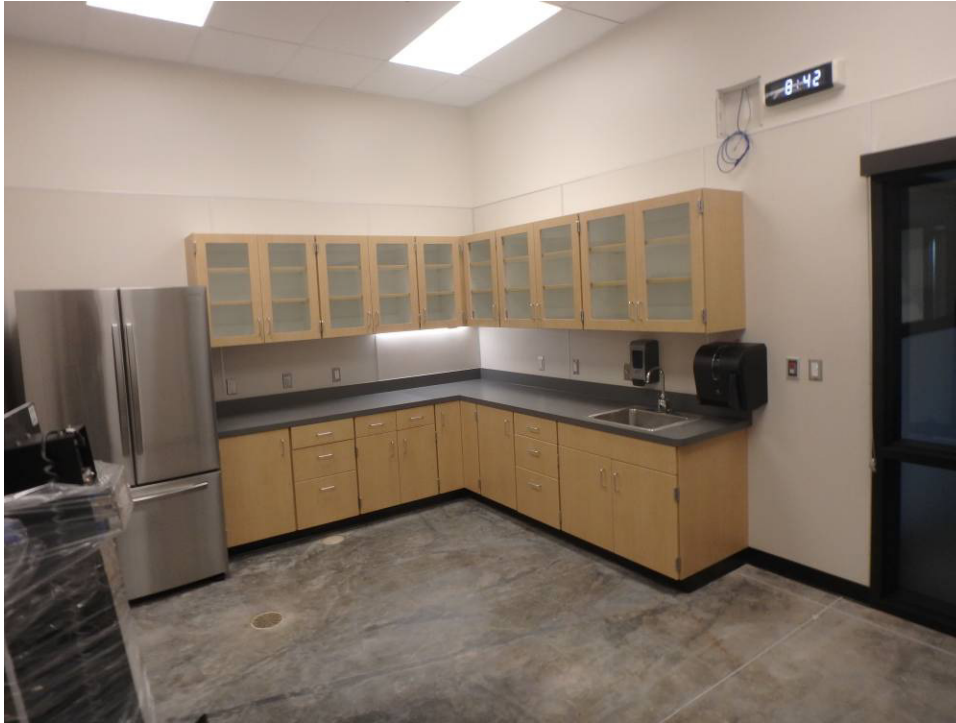
Exam room casework