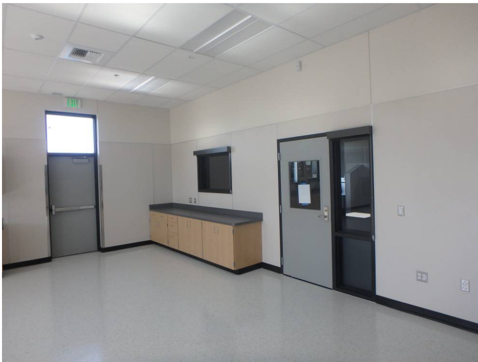
Looking southwest at the southwest corner of the south classroom