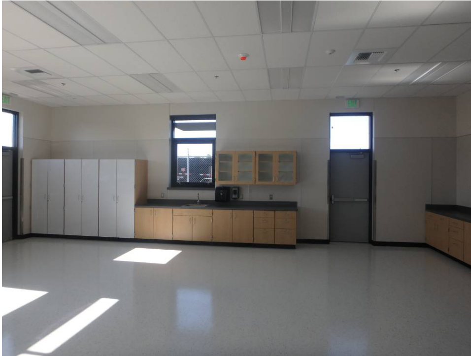
Looking south at the south wall of the south classroom