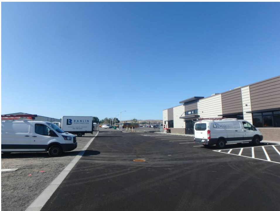
Looking south at the parking area