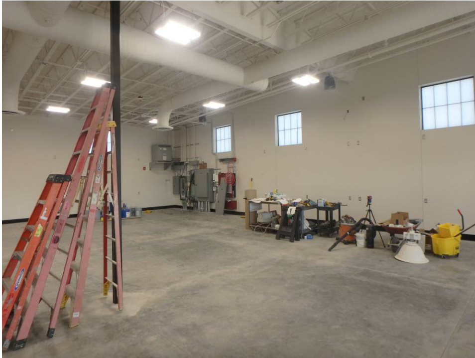
Looking northwest towards the shop's electrical panels and transformer mounted on the wall