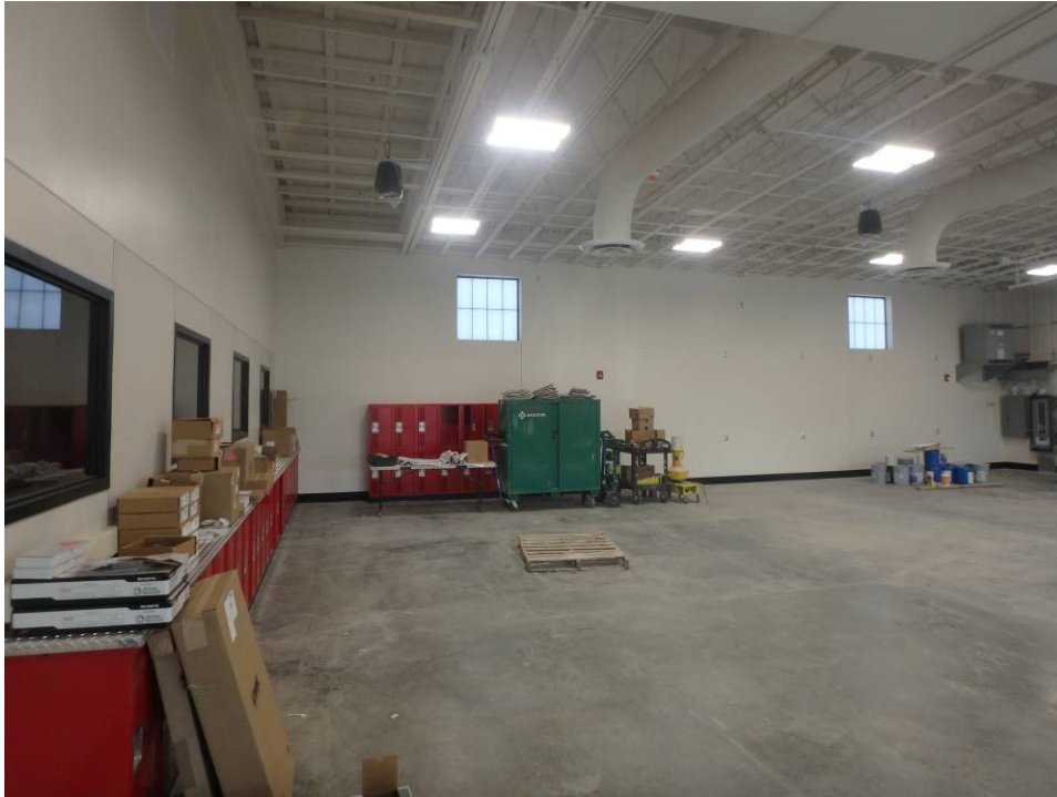
Looking west at the south wall of the shop