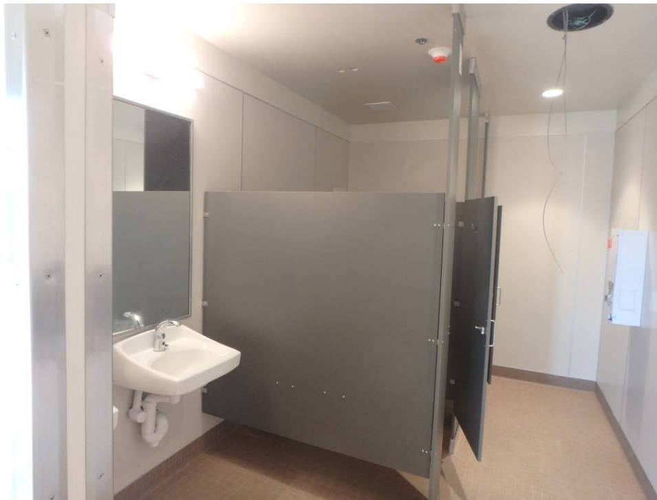
Restroom partitions and architectural accessories