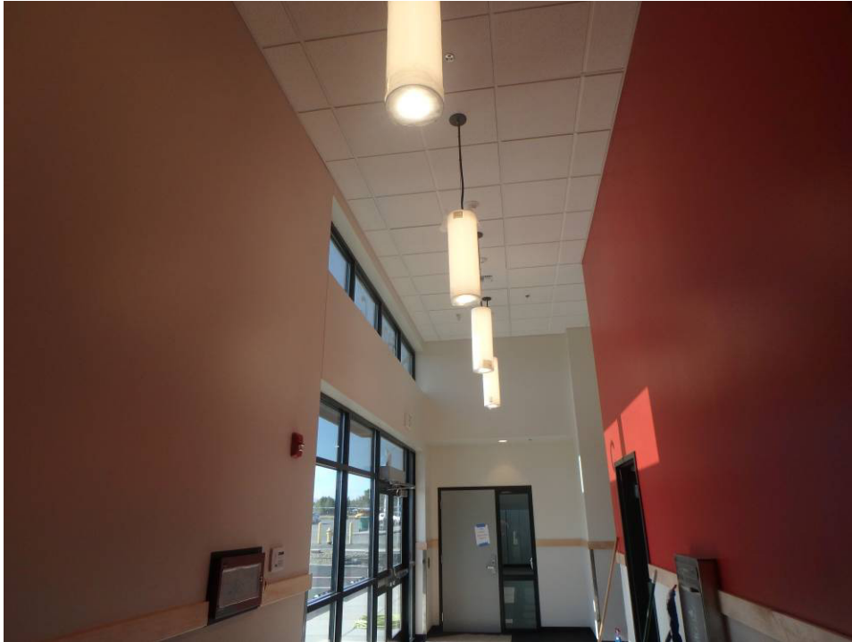
Looking south at the entry