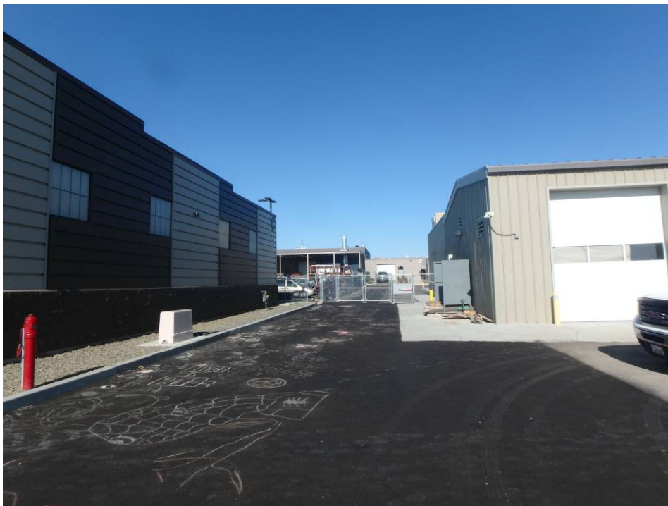
Alleyway – looking west and the North elevation