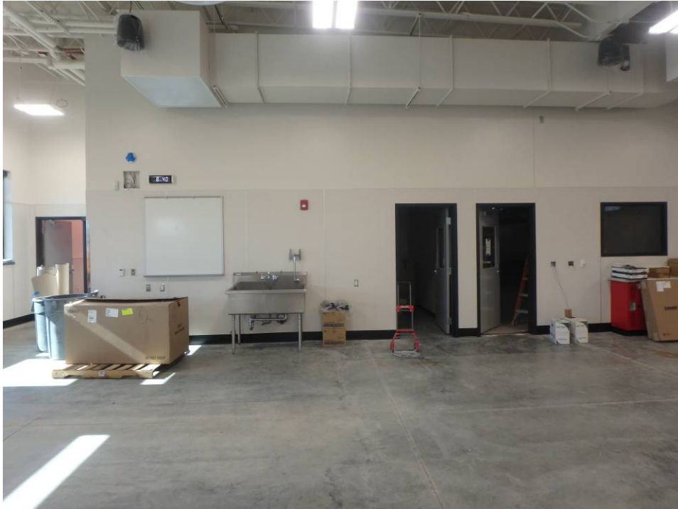
Looking south at the north classroom south wall