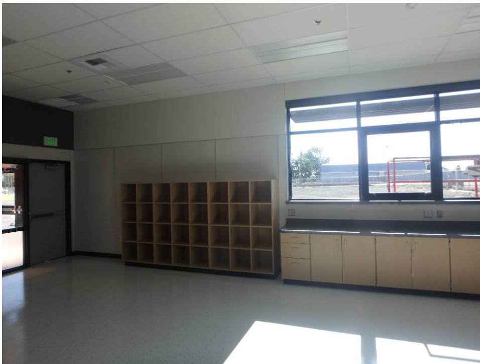
Looking at the casework on the east wall of the south classroom-north end