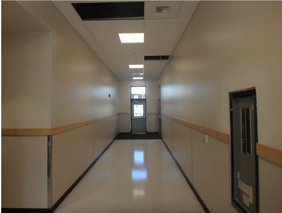
Looking west at the main east-west corridor