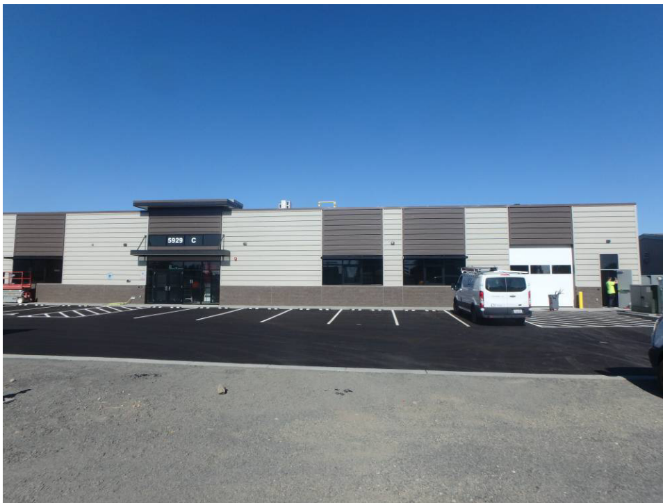
Looking at the north end of the East elevation