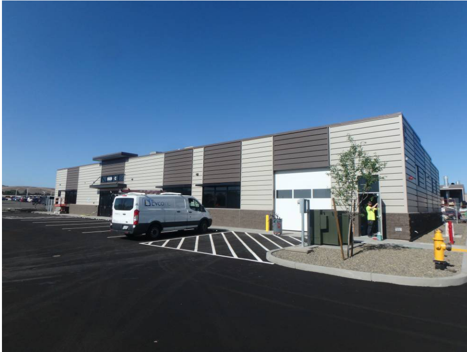
Looking at the northeast corner of the building