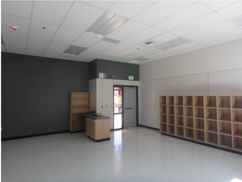
Looking at the casework in the northeast corner of the south classroom