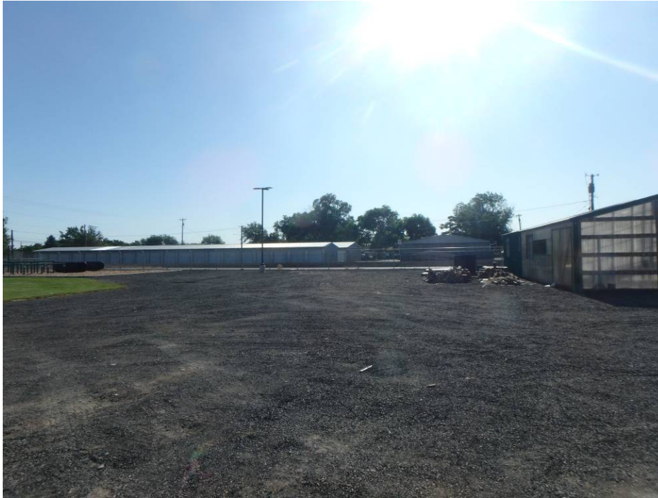
Looking northeast at the northeast corner of the site and the greenhouse