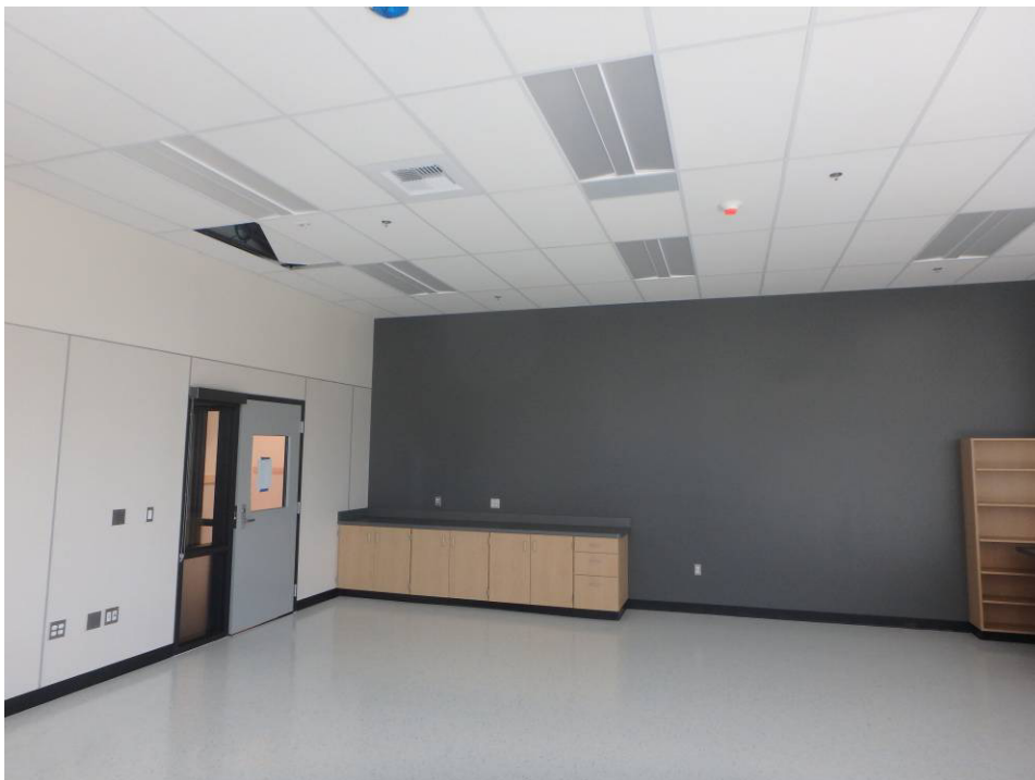
Looking at the casework in the northwest corner of the south classroom