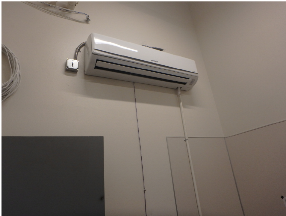
Mechanical room –minisplit unit