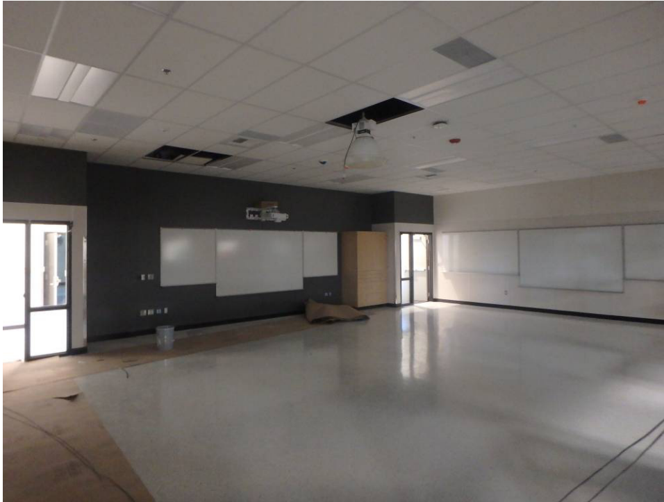
Looking southwest at the southwest corner of the north classroom