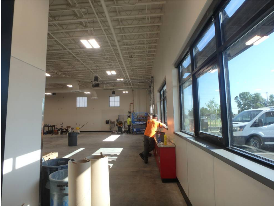
Looking north along the shop's east wall and lockers with diamond plate top