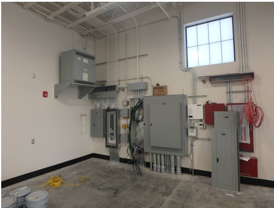
Electrical panels, and transformer