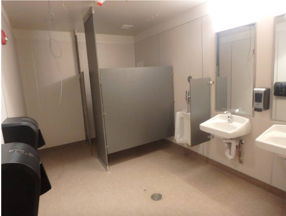
Men's Restroom partitions and architectural accessories