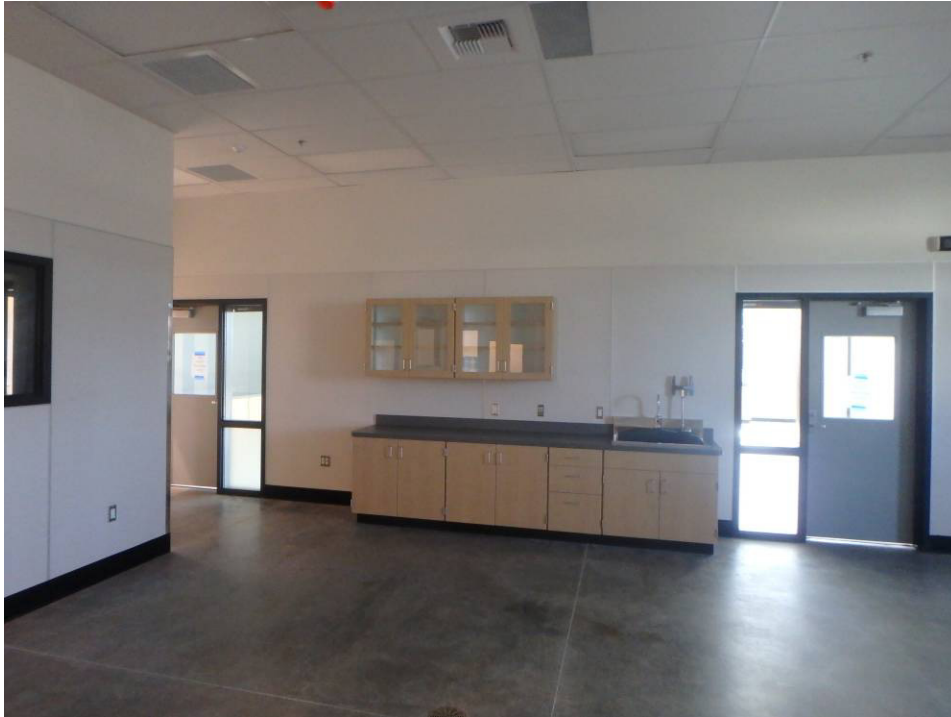
Lab – eyewash station and east wall