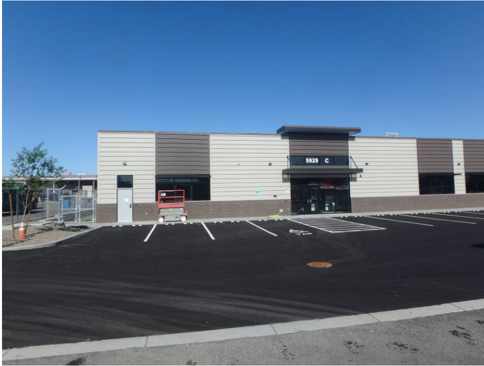
Looking at the south end of the East elevation