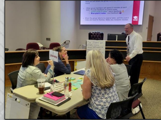
April 18, 2023