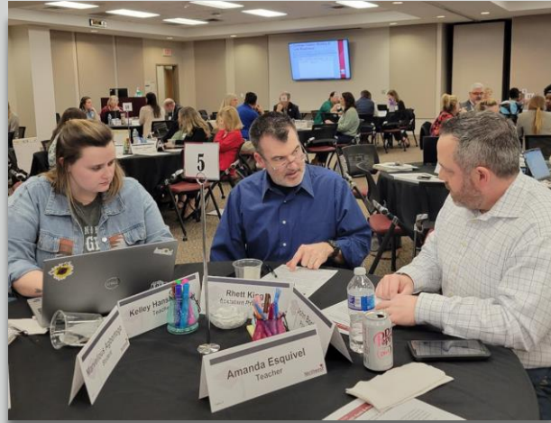
March 1, 2023