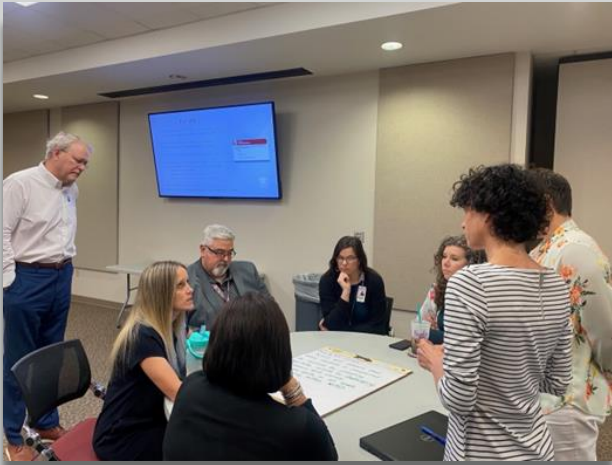
April 4, 2023