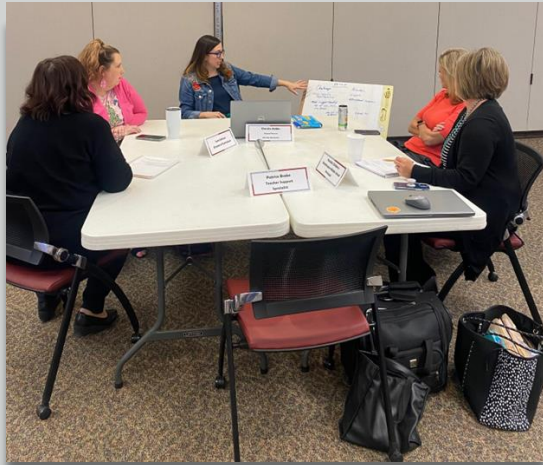
April 6, 2023