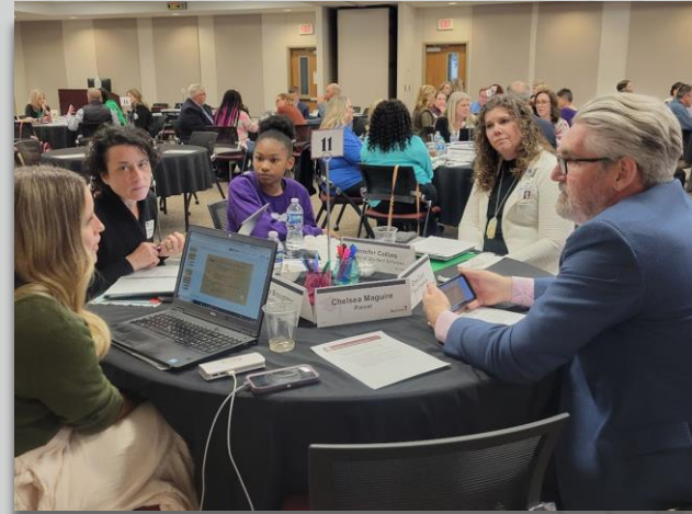
March 28, 2023