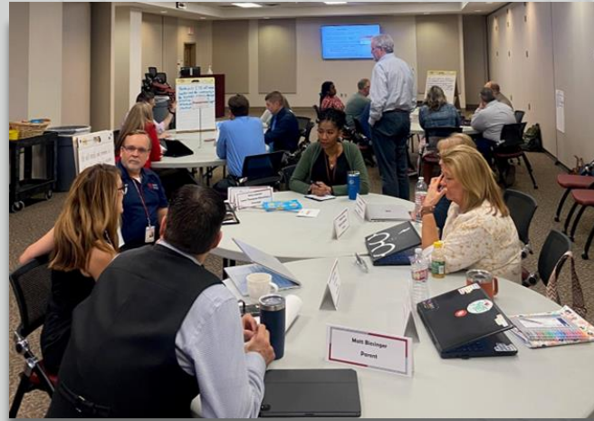
April 11, 2023