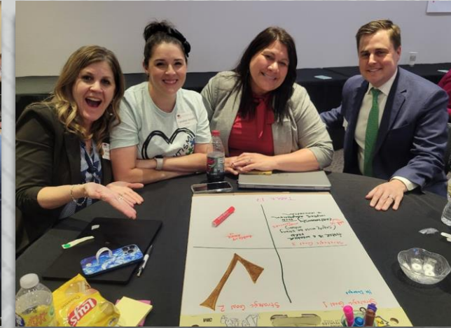
April 20, 2023