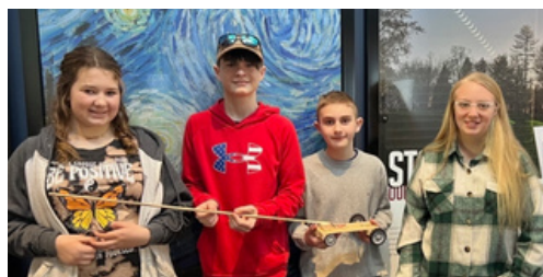
Congratulations to Lakewood's STEMfest 2023 winners! The competition, hosted by The Works: Ohio Center for History, Art & Technology, challenged students to reimagine how we live in the world and envision change for our future.