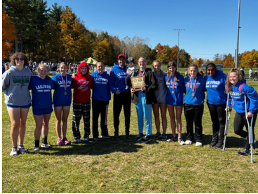
Girls Cross Country - LCL Champions!