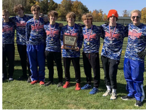
Boys Cross Country - LCL Champions!