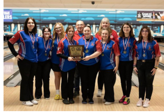
Girls Bowling - LCL Champions!