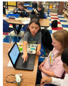
JIS Tech Club - Third-grade students learning about coding and circuits.