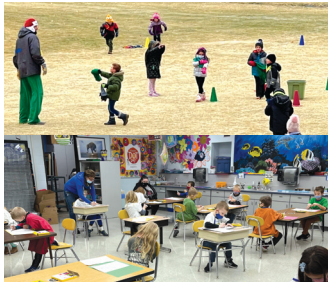
A view of kindergarten students participating in phy-ed and art.

At Albertville Primary we believe that students need a well-rounded educational experience. While Reading and Math are fundamental, we also include weekly opportunities for students to extend their capabilities and knowledge-base by participating in physical education, music, art, and computer. Excellence Starts Here!