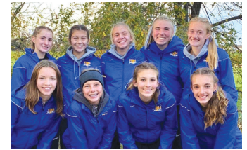
Girls Cross Country Team Section 5AA Champions