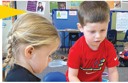
Gingerbread crafts at Bright Beginnings.

We are bringing back Dome Days! Beginning January 13, the Dome will be