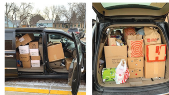
This is load 1 of 2 to the Hanover Food Shelf. We appreciate the generosity of our families.