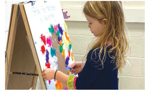
Our ECCE classes are always a blast.

The STMA Dome is up and running for its third year out at the high school athletic stadium! We were excited to welcome everyone back into our spaces to a full rental schedule. We are renting to our many returning youth and adult athletic organizations again, as well as welcoming a few new teams and groups for the season. The dome will be available to rent through the first week in April.