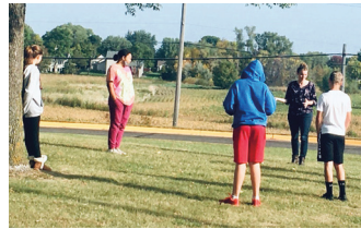
Students in Ms. Wagner's classroom find a space outdoors to continue their lesson.