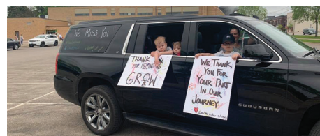
We love our ECFE Families! We ended the year with a drive-by parade celebration last spring.

We will be hiring Dome Attendants this fall- please keep an eye out for the job postings on the school district website or watch for the hiring posters in the entryway outside the Activity Center Office. You must be at least 16 years old to apply.