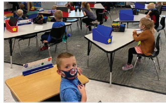
A view of kindergarten students learning in their classroom.

Welcome to kindergarten and preschool at Albertville Primary! This fall brought many changes in terms of how we view the classroom. Current safety precautions may have us wearing masks and physically spread apart, but students are unfazed and are happy to be at school learning! Together with families, we can accomplish anything!