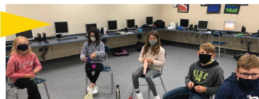
Some middle schoolers enjoying Yarn Club!

We are very excited to be offering classes this fall both in-person and online! Classes will be added throughout the fall season. Please keep checking the website at stma.ce.eleyo.com for class offering updates & additional added classes. We are keeping up with social distance guidelines and have safety protocols in place for our enrichment. Boys Basketball for grades 5 and 6 begins October 29. Boys Basketball for grades 1-4 begins in January.