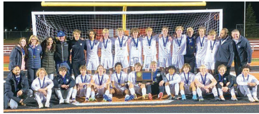
Section 8AAA Boys Soccer Champions