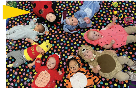
Dress up fun in ECFE's Baby and Me class!

Children ages three to five are eligible for early childhood screening through