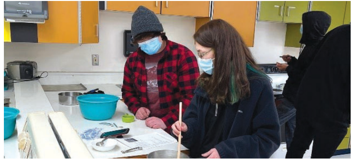
An example of Project Based Learning (PBL) in a Knights Academy Food Chemistry class.