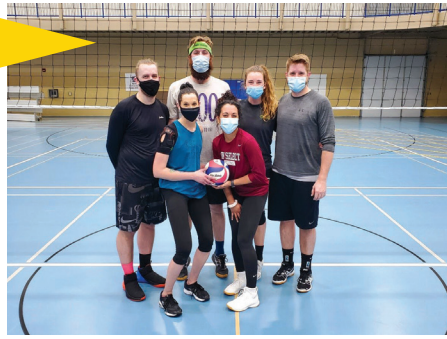
Congratulations to our winter Adult Volleyball league Power division champs, the Ridiculous Six!

From paint labs, battle drones, babysitting, to clay camp, we have something for everyone! Help them develop a new interest or meet some new friends, all while having a blast. We expanded our STEM offerings, added a new youth Generation Pound class, and are introducing our new Chinese classes! Check out our Youth Enrichment section of the brochure, pages 22-31, for our full class listings.