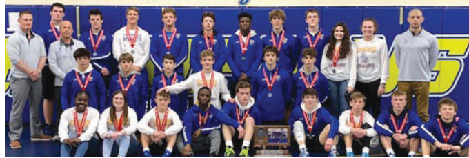
Wrestling Team State Runner-up