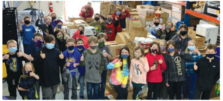
4th Grade Student Leaders at Big Woods Elementary loading all 4,220 items for the Hanover Food Shelf.

Students at Middle School East have recently enjoyed celebrating Spring Week by dressing up on school spirit day and participating in a variety of activities. 7th grade students and science teachers enjoyed learning the art of making maple syrup by tapping our school forest trees in the Big Woods Forest. Such a wonderful asset to our school community!