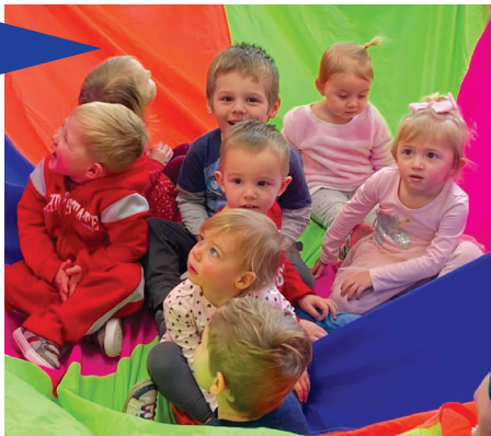
Parachute time during ECFE makes class so colorful!

Classes are online until the fall. Call 763-497-6550 ext 1 for information