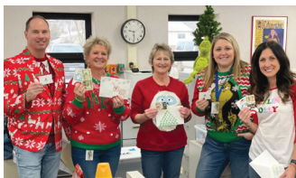
Bright Beginnings and Kindergarten families donated money for conference meals and staff appreciation gifts.

The week of December 20 was set aside for families to show their gratitude and appreciation for the hard work, great care, and deep commitment staff give to students day in and day out. Our Bright Beginnings and kindergarten families rose to the occasion with an outpouring of generosity. Thank you, families!