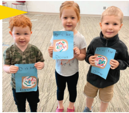
ECFE is at the library every Tuesday morning!

The STMA Dome is up and running at the high school athletic stadium! We were excited to welcome everyone back into our spaces to a full rental schedule. The Dome will be open to children ages 6 and under on Wednesdays and Fridays from 8:15-9:30am for play under the big bubble! This is an open play opportunity and parents are expected to stay with their children. $2 per child or $5 family.