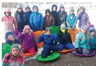
Here is a 2nd grade class enjoying the sleds during recess.

During the winter months, our students enjoy recess in the snow by making forts, playing on the snow hill, making snowmen, and other fun snow activities. Last year, we added sledding as another option for students to have fun in the snow. Each class gets to sled on a rotating basis during recess. Thank you to the STME PTO for donating the sleds to our school!