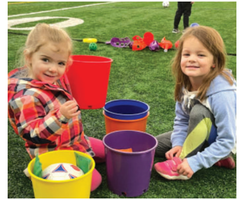
We are back in action at the Dome!