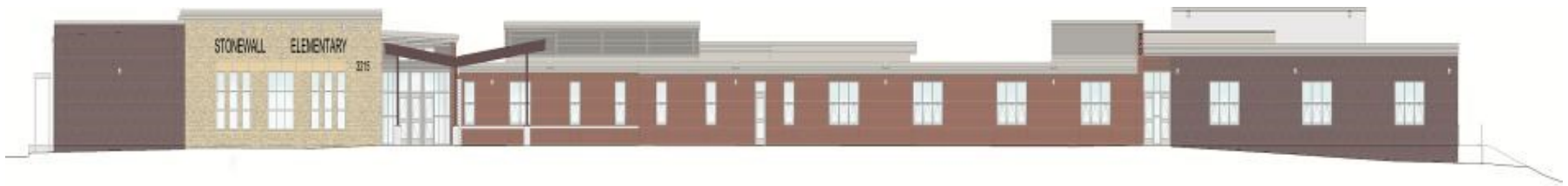
STONEWALL ELEMENTARY - EAST ELEVATION