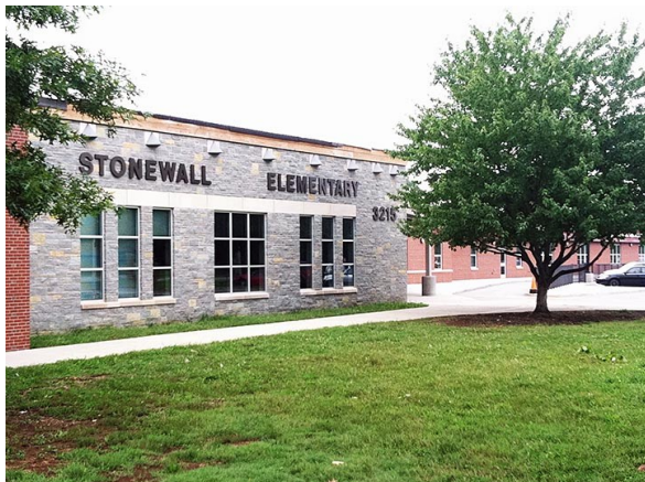
New Front Façade