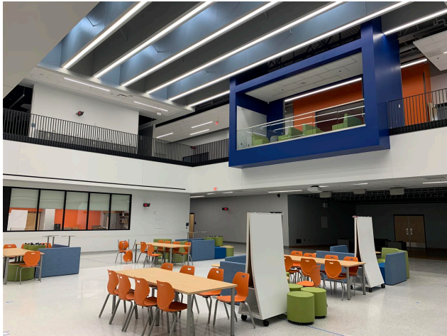
STEAM -- Multipurpose Space