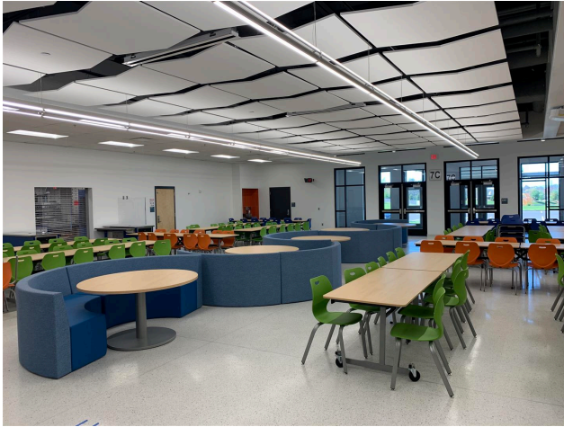
STEAM & Success -- Café