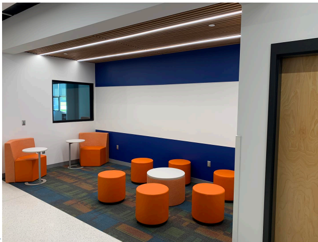
Success – Commons Area