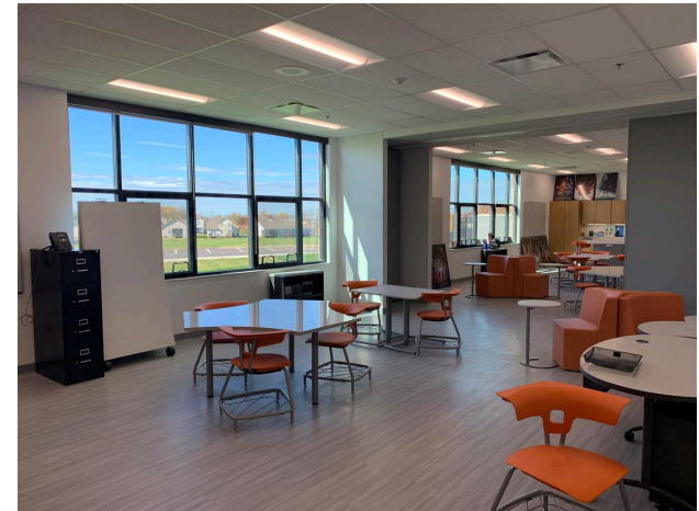
Success -- Classroom