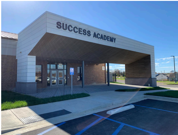
Success -- Visitor Entrance