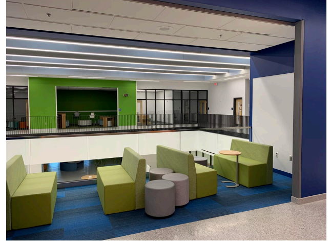
STEAM -- Commons Area