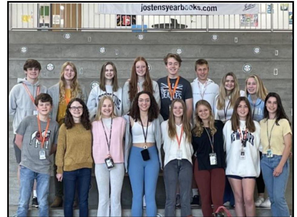
FDHS congratulates our 17 Juniors who were selected for the 2022 Governor's Scholars Program!

15 students received the Seal of Biliteracy in 2022, recognizing seniors who demonstrated high level proficiency in English and one or more world languages.