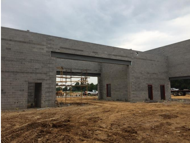
Interior of Gym