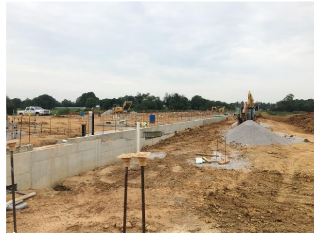
Perimeter Foundations (E)