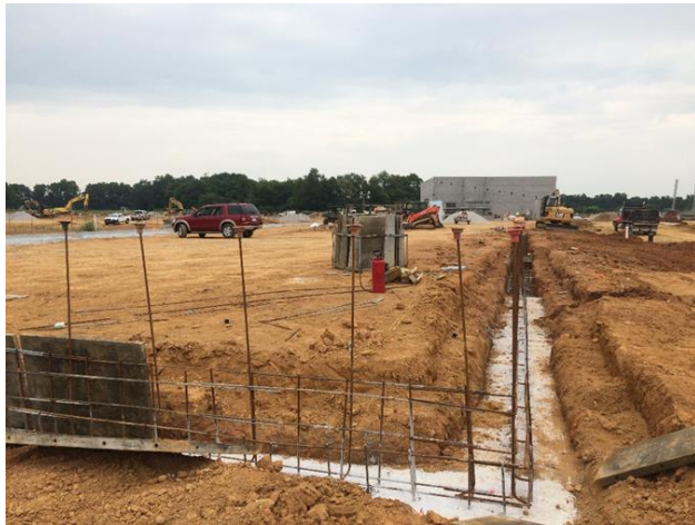
Perimeter Foundations (A)