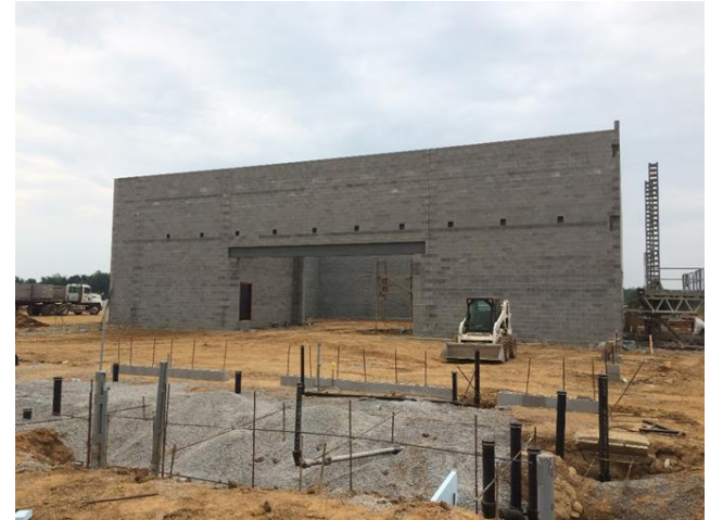
Café – Stage