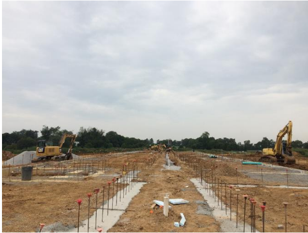
Interior Footers (E)