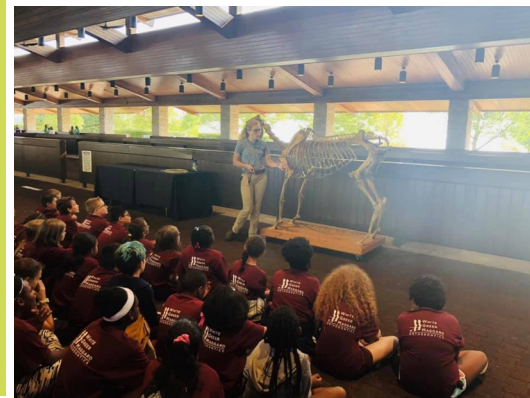
BCE fifth graders attend their first field trip at Keeneland.