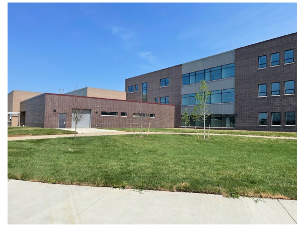
Area B – Exterior Woodshop