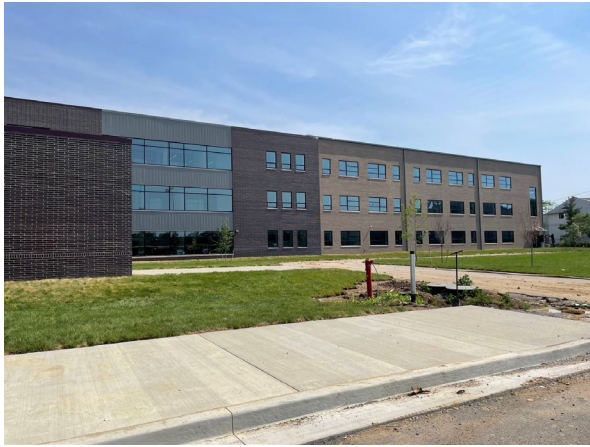
Area B – Exterior South Façade