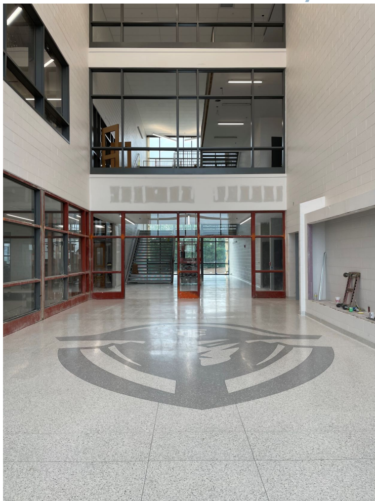
Area D – Entrance Lobby