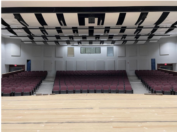
Area C – Auditorium Seating