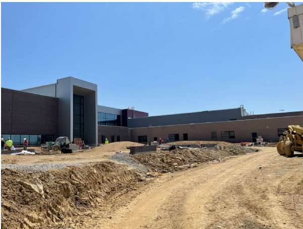
Exterior Entrance Plaza