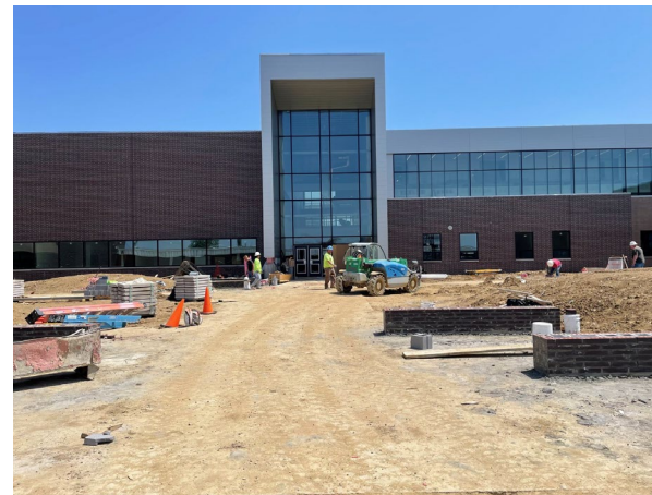
Exterior Front Entrance