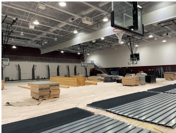
Area F – Main Gym Bleachers