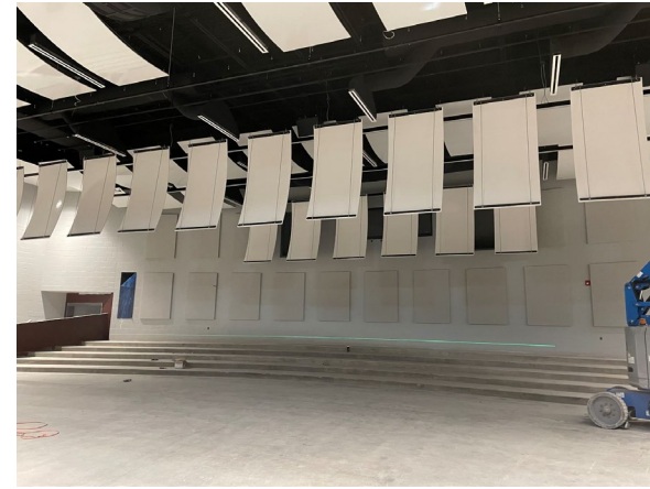
Area C – Auditorium