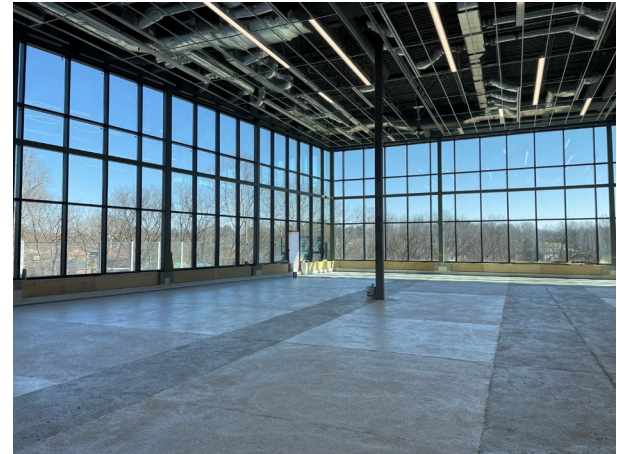
Area E – Terrazzo & Lights