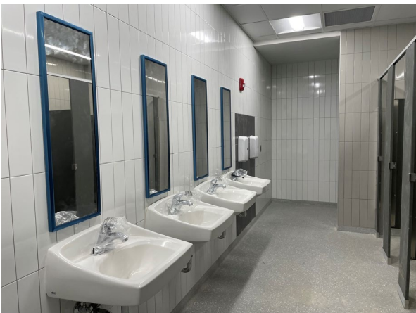
Area A – Restroom