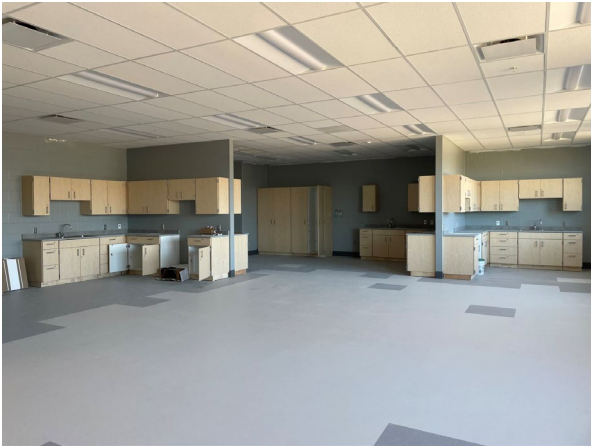
Area A – Lower Family/Consumer Science