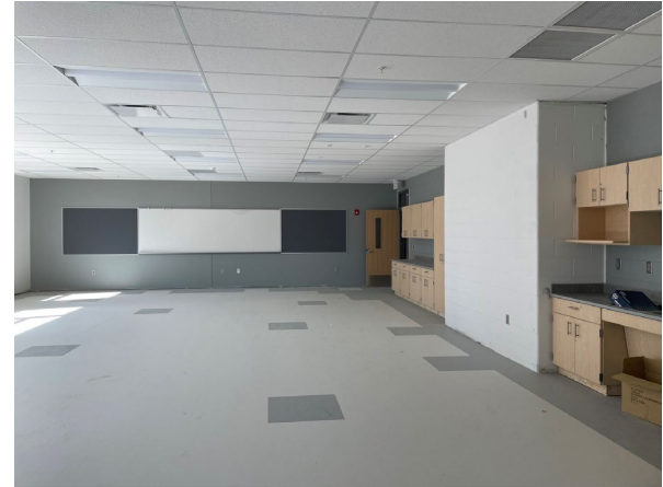
Area A – Lower Floor Tile