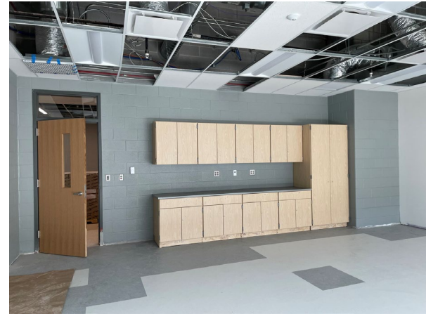
Area A – Main Casework