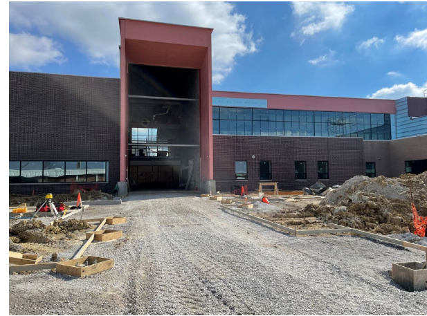
Exterior Front Entry