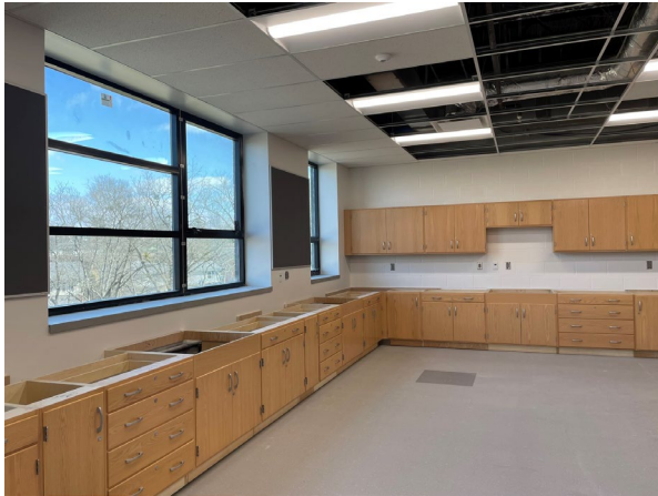
Area A – Lower Science