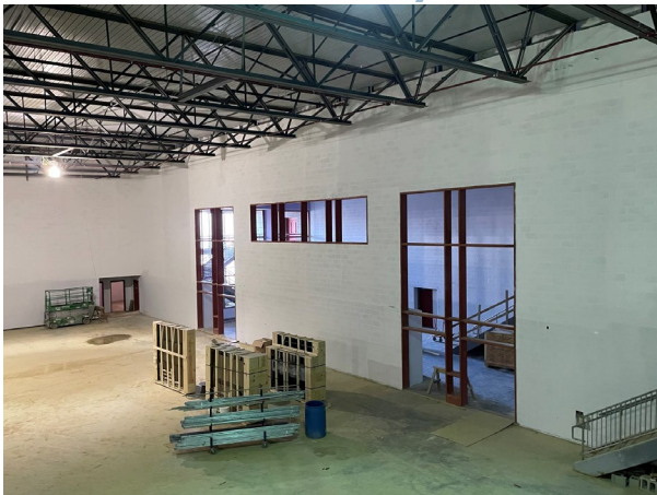
Area F – Main Gym Paint