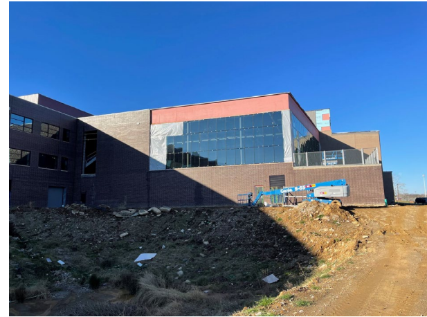
Exterior East Café