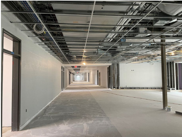
Area A – Terrazzo & Ceiling Grid