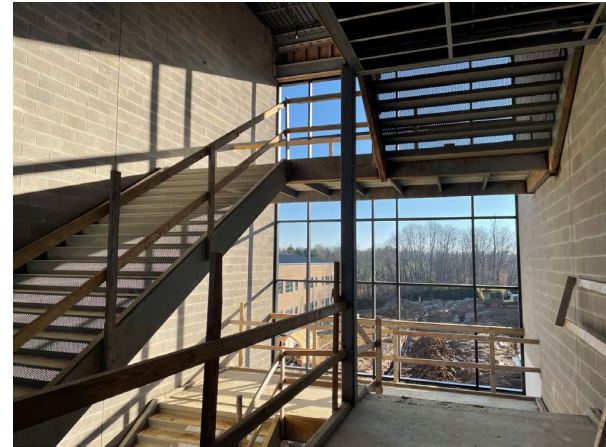
Area D – Main Lobby Stair