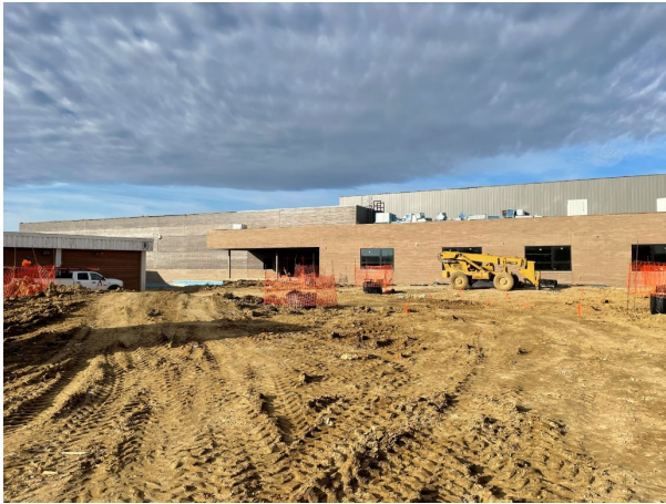
Area E – South Façade