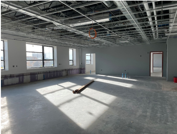
Area B – Main Science Ceiling Grid