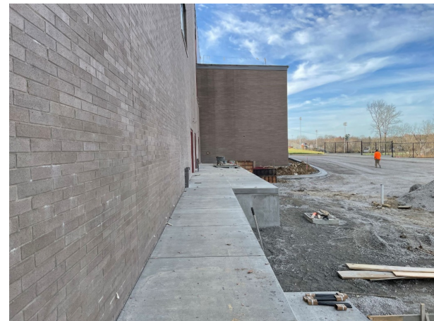
Exterior Loading Dock