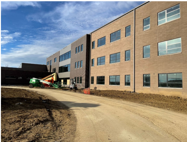
Area B – South Façade