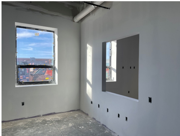
Area D – Health Clinic