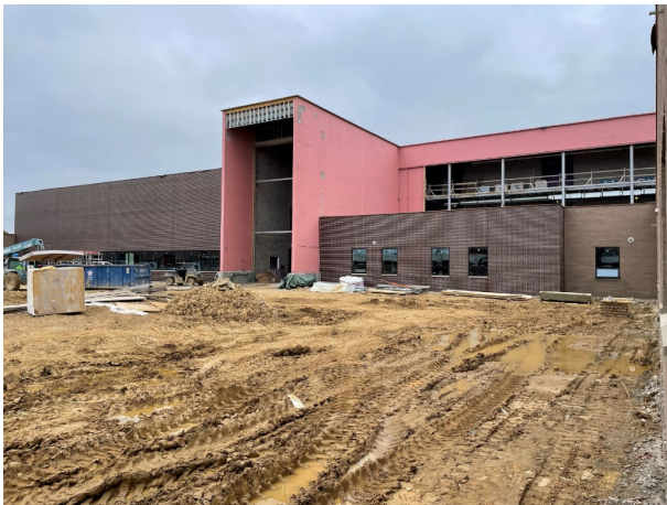
Area D – Front Entrance