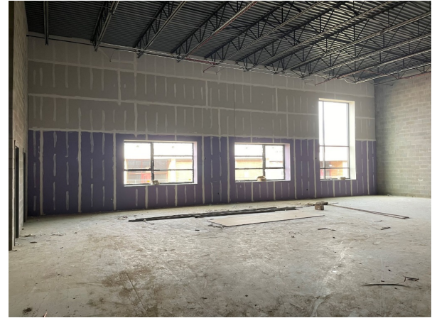
Area C – Orchestra Room Gyp