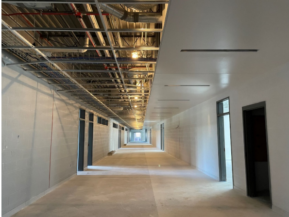
Area A – Main Level Ceiling Grid