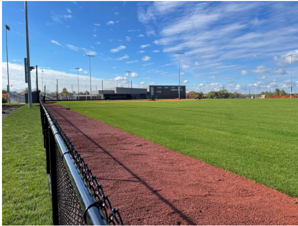
Baseball Field & Field House