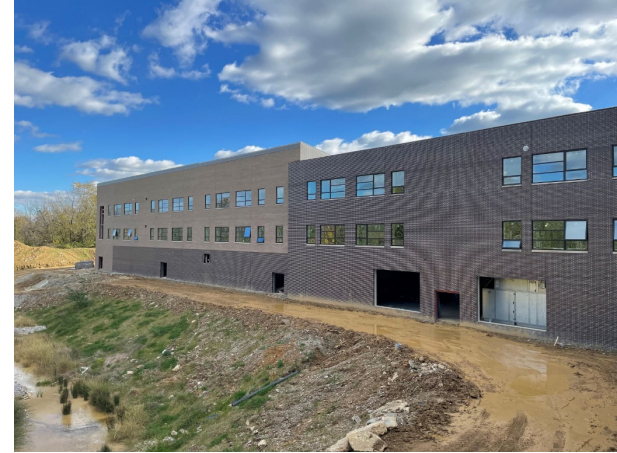
Area A – North Façade