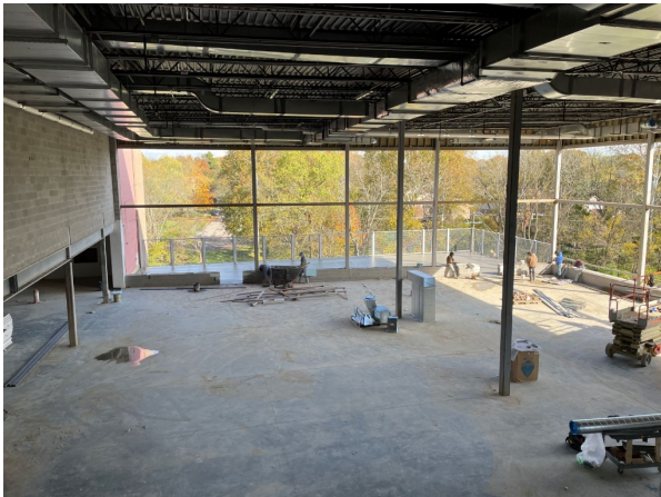
Area E – Café Outdoor Patio