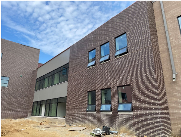
Area A (South) – Brick