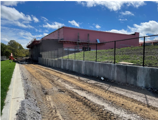
Area F (West) – Brick