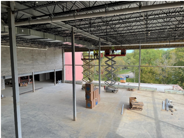
Area E – Café Ductwork