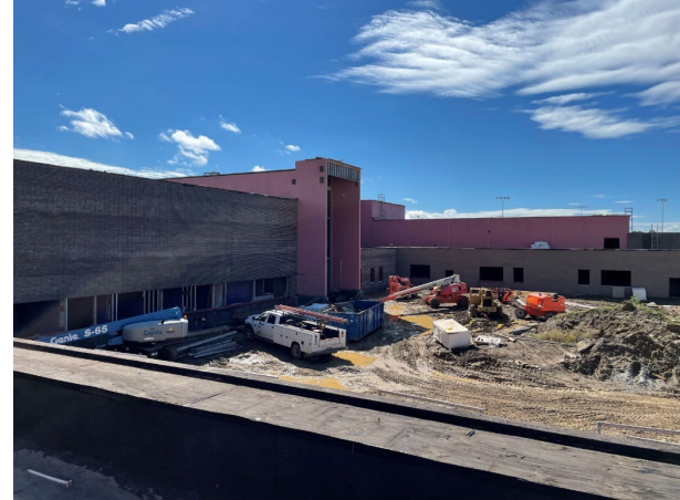
Area D – Front Entrance Brick