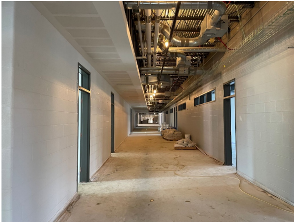
Area A – Lower Level Paint