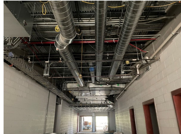
Area D – Main Level Duct & Piping