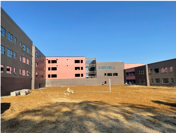
Exterior Area D – East Facade