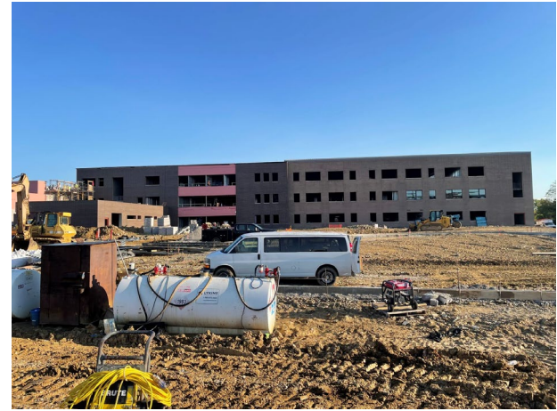
Exterior Area B – South Facade