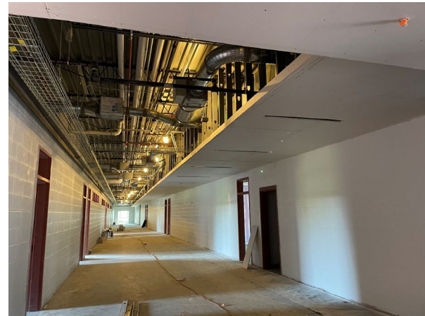
Area A – Main Level Paint