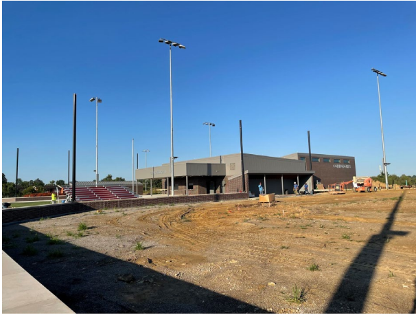
Baseball Bleachers & Netting Poles