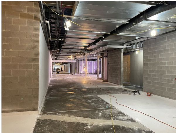
Area A – Lower Level Terrazzo