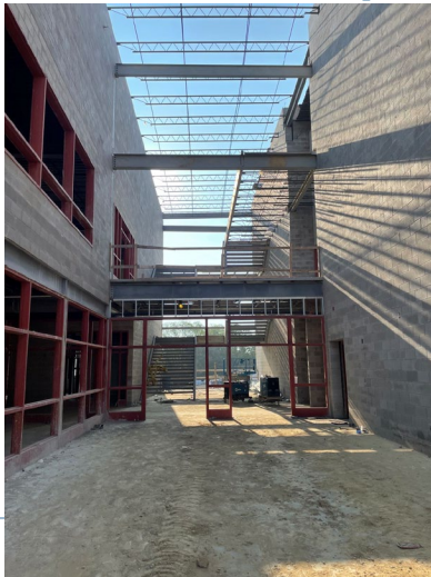
Area D – Main Lobby Stairs