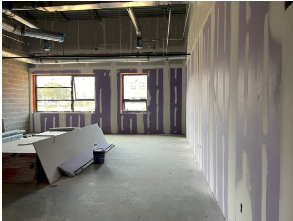
Area A – Gypsum Installation