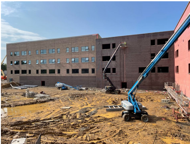
Area B – Brick North Façade