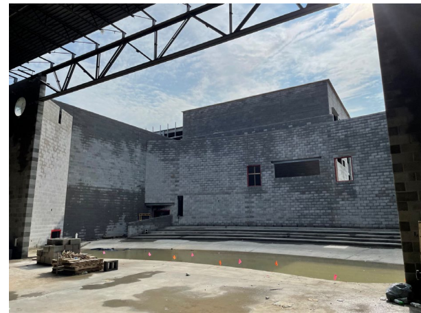
Area C – CMU at Auditorium