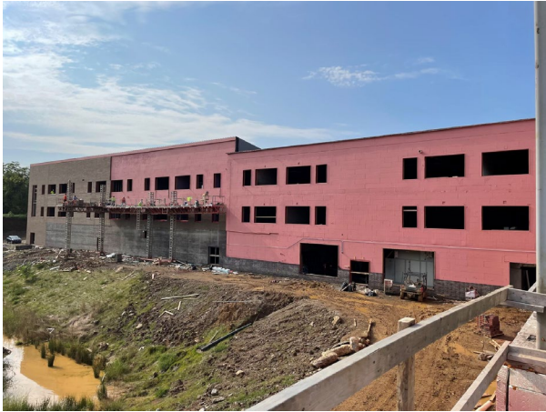
Area A – Brick North Façade