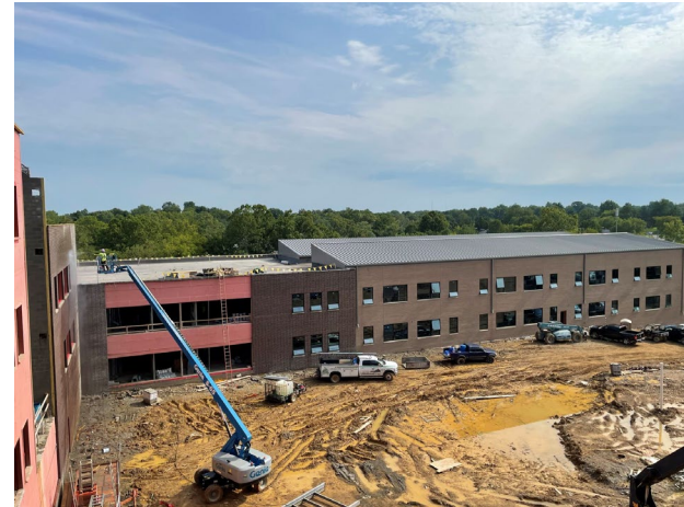
Area A – Brick South Façade