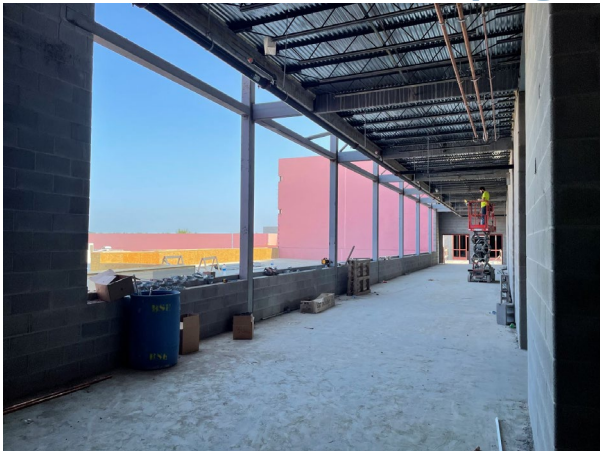
Area D – 2 nd Level Piping