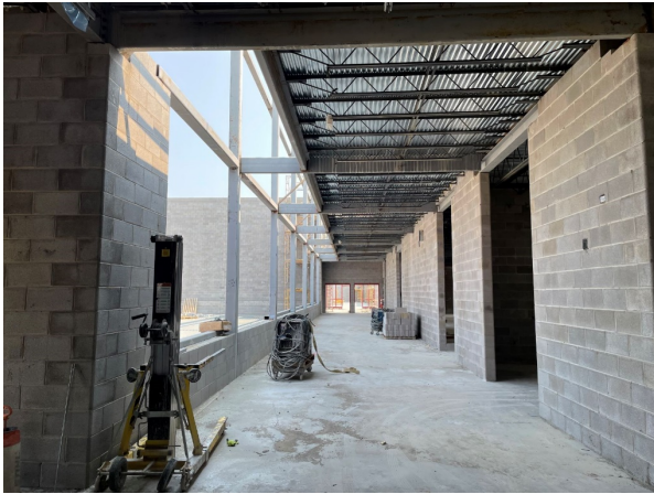
Area D – 2 nd Level Floor Joists