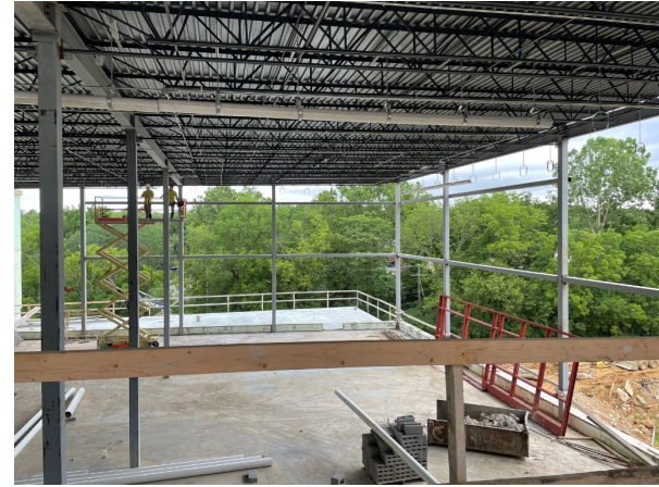
Area E – Piping