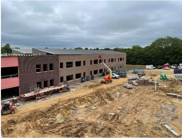
Area A – Brick