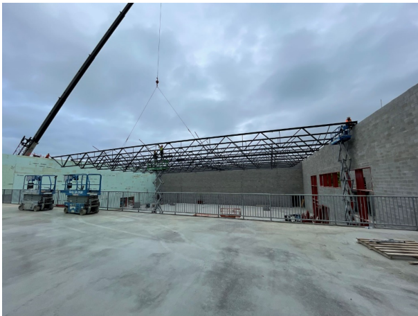
Area F – Joists