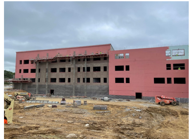
Area B – Brick