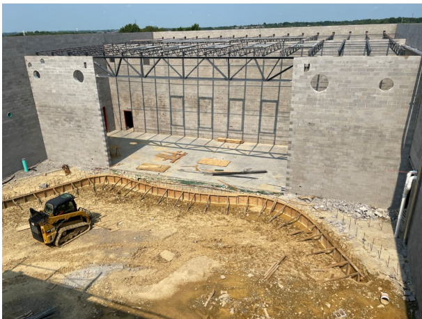
Area C – Auditorium