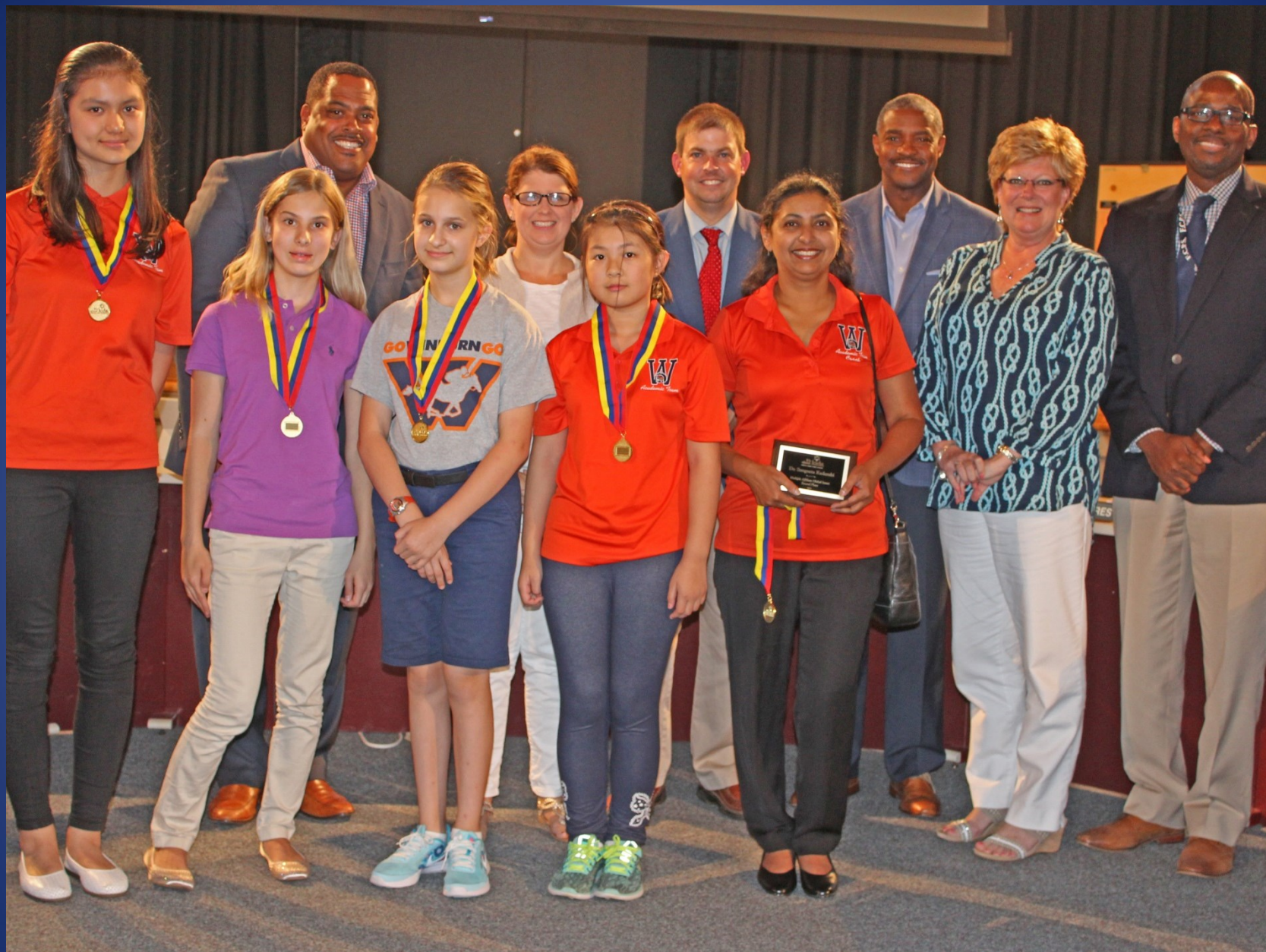
An FPS team from Winburn Middle School was a junior division champion in the Future Problem-Solving Program International competition this summer.