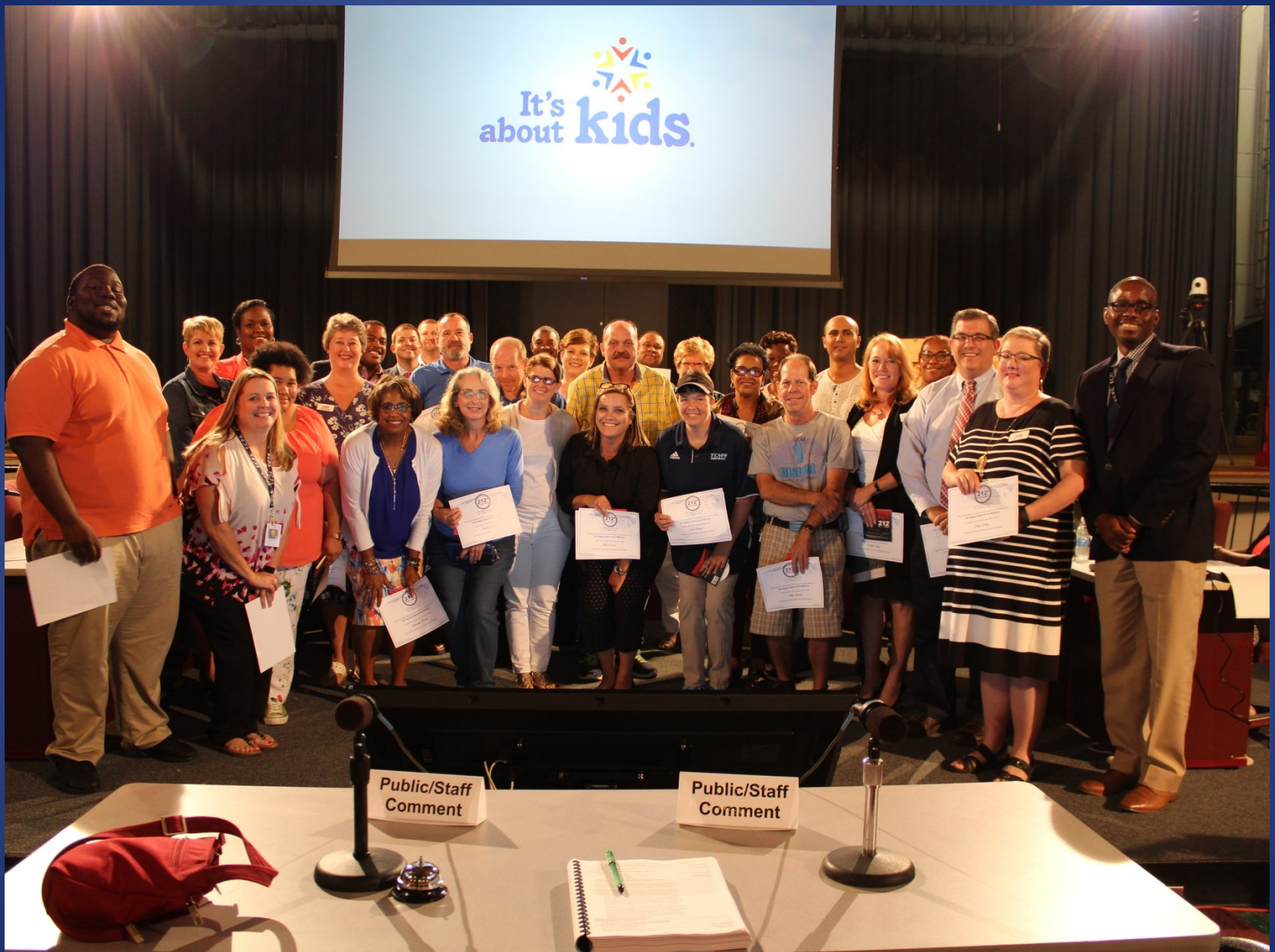
This month's "212 Degrees Award," given to employees who go above and beyond the call of duty, went to the staffers who made sure the second annual Superintendent's Leadership Institute ran smoothly.