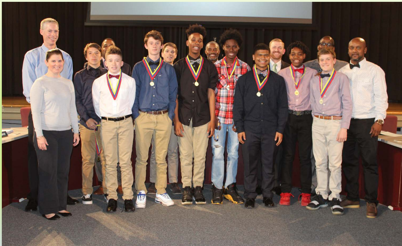
The boys' "B" basketball team from Southern Middle School won the citywide tournament.