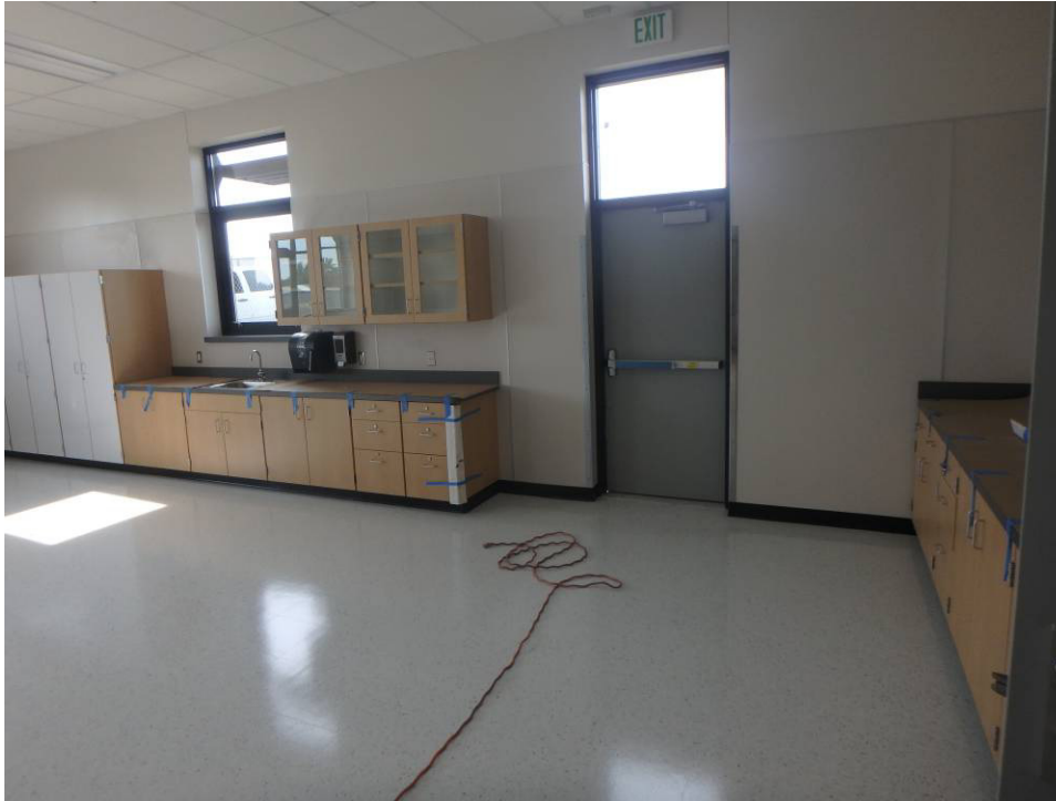
Looking at the southeast corner of the south classroom