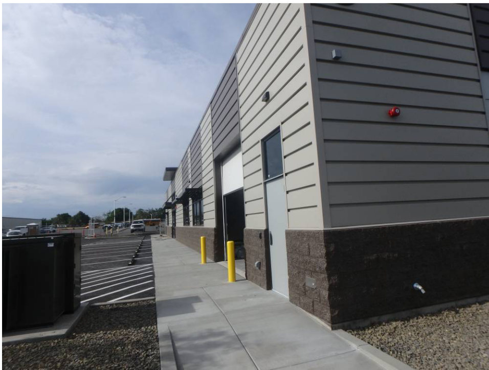
Northeast corner of the building and looking south along the front sidewalk