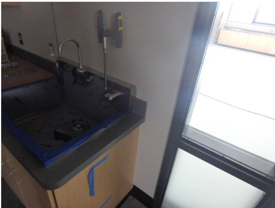
Lab – eyewash station