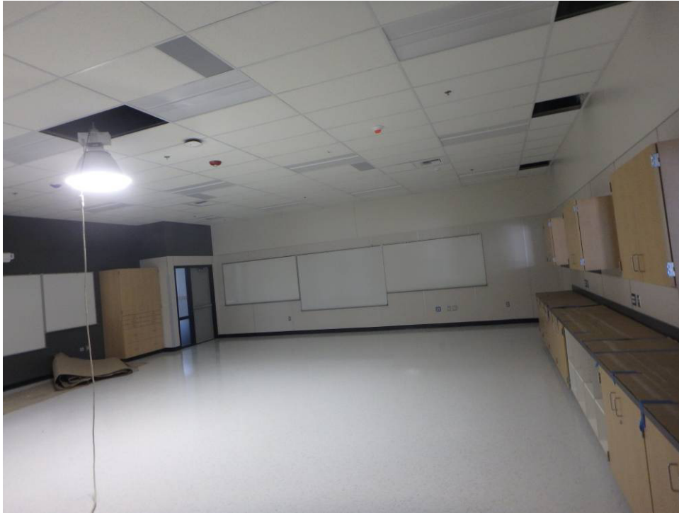
Looking west at the west wall of the north classroom