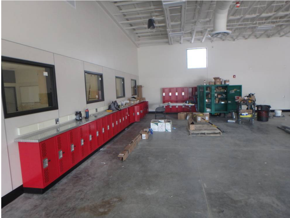
Looking west along the south wall of the shop