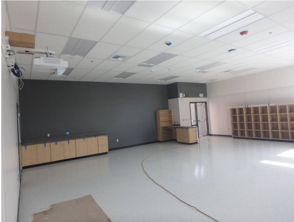
Looking at the casework in the northeast corner of the south classroom