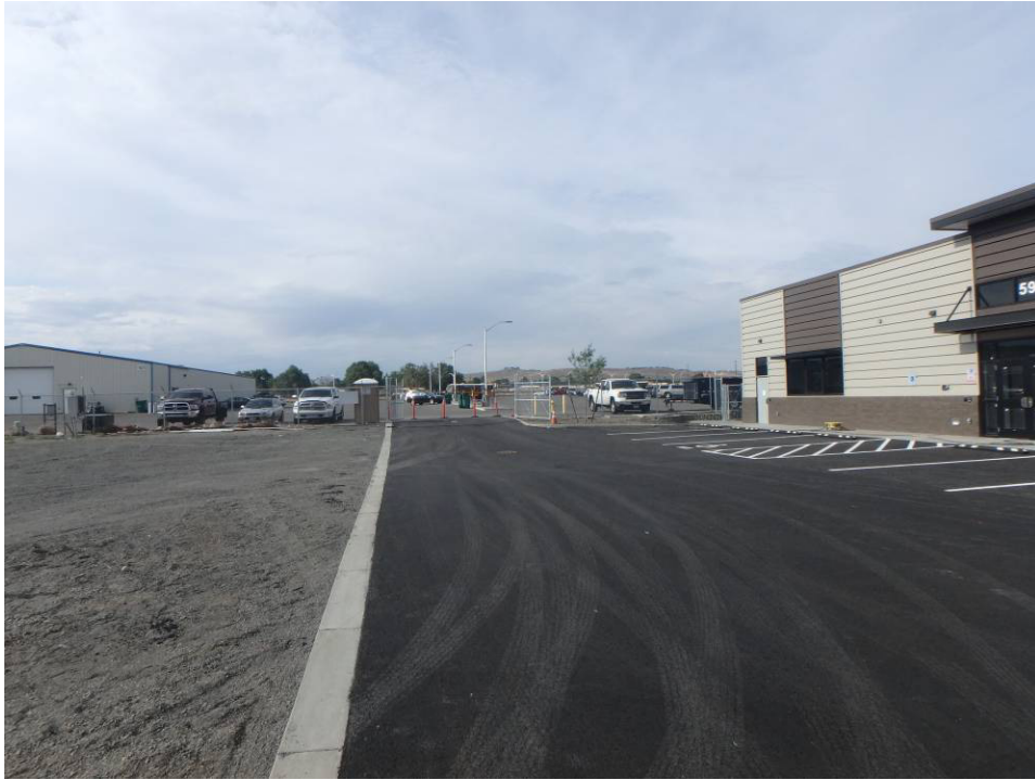
Looking south along the central curb