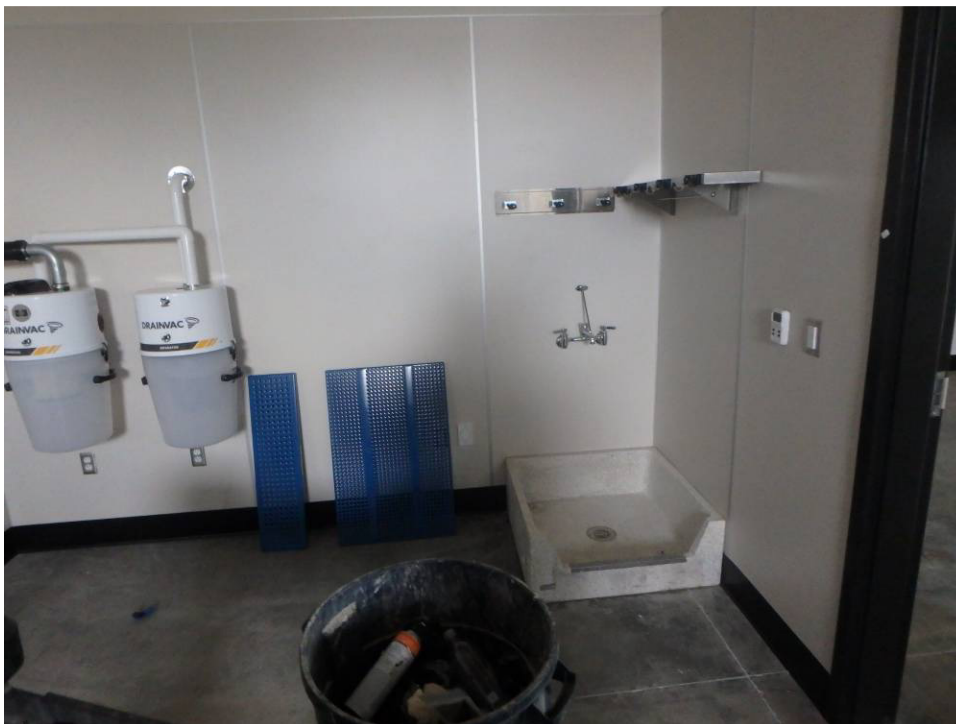
Kennel Room vacuum and sink on the north wall