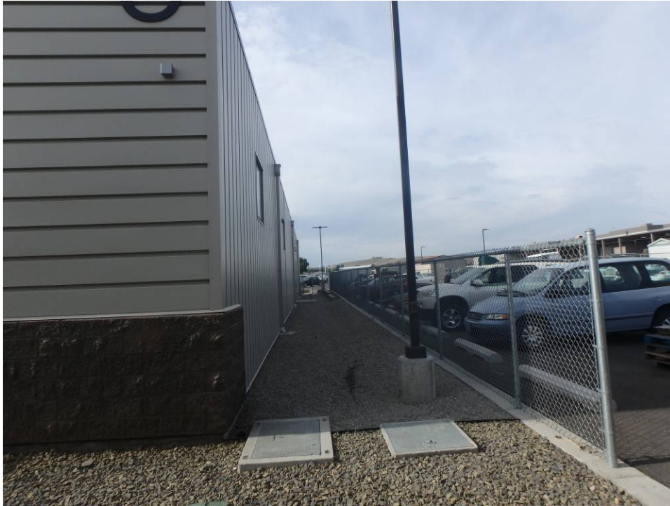
Looking south along the west property line and the back of the building