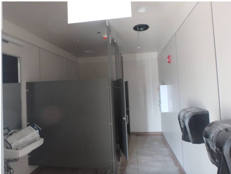
Restroom partitions and architectural accessories