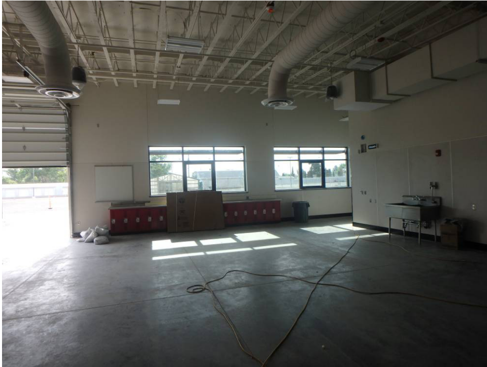
Looking east at the east wall of the shop