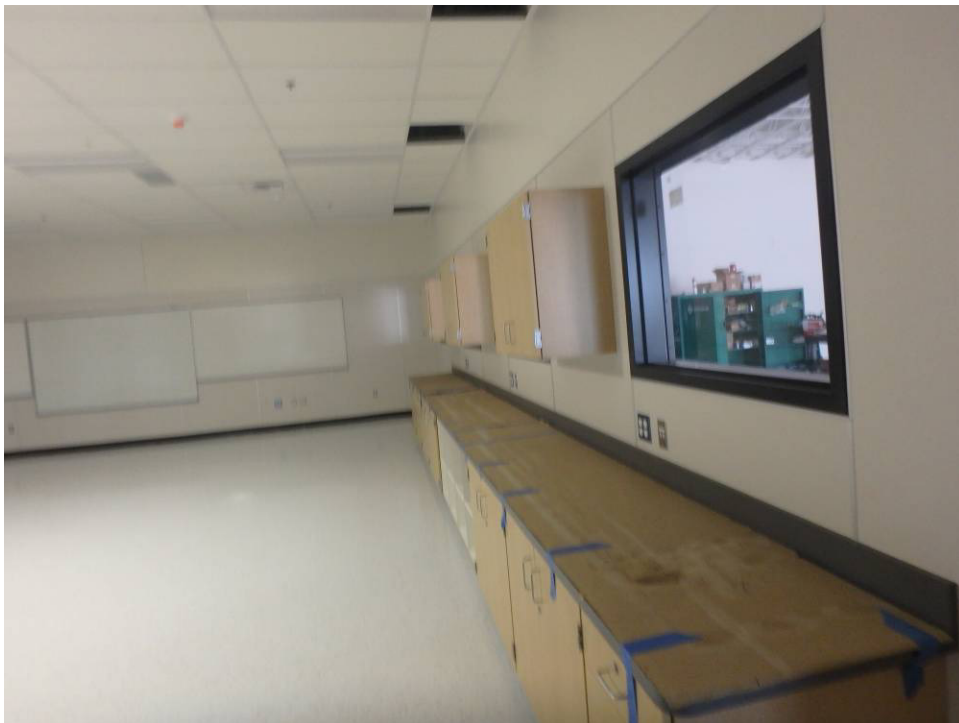
Looking west at the north wall of the north classroom