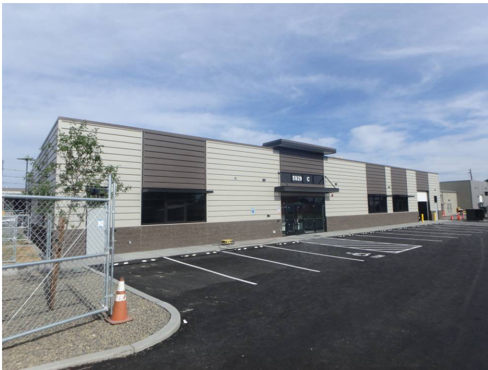
Looking north at the East elevation