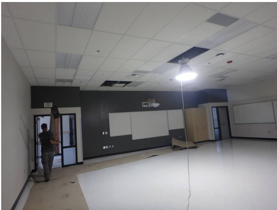
Looking south across the north classroom east wall