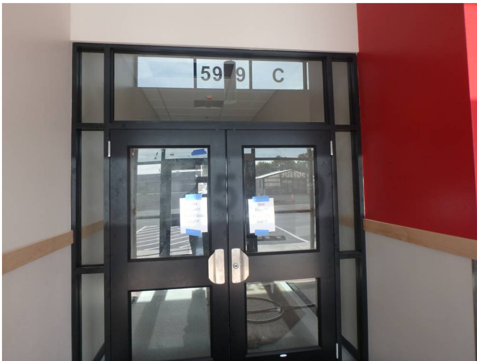
Vestibule inner doors