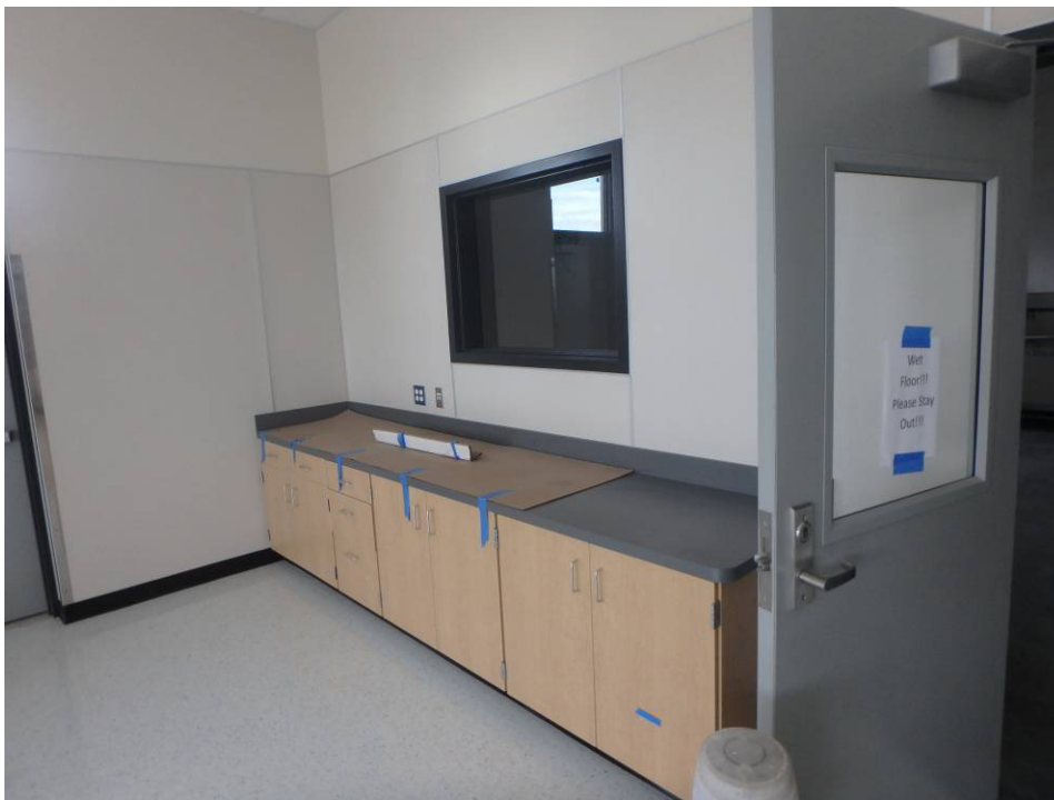
Looking southwest at the southwest corner of the south classroom