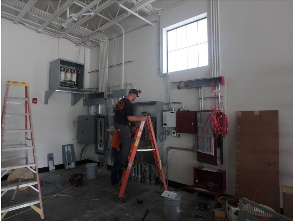
Looking northwest towards the shop's electrical panels and transformer mounted on the wall