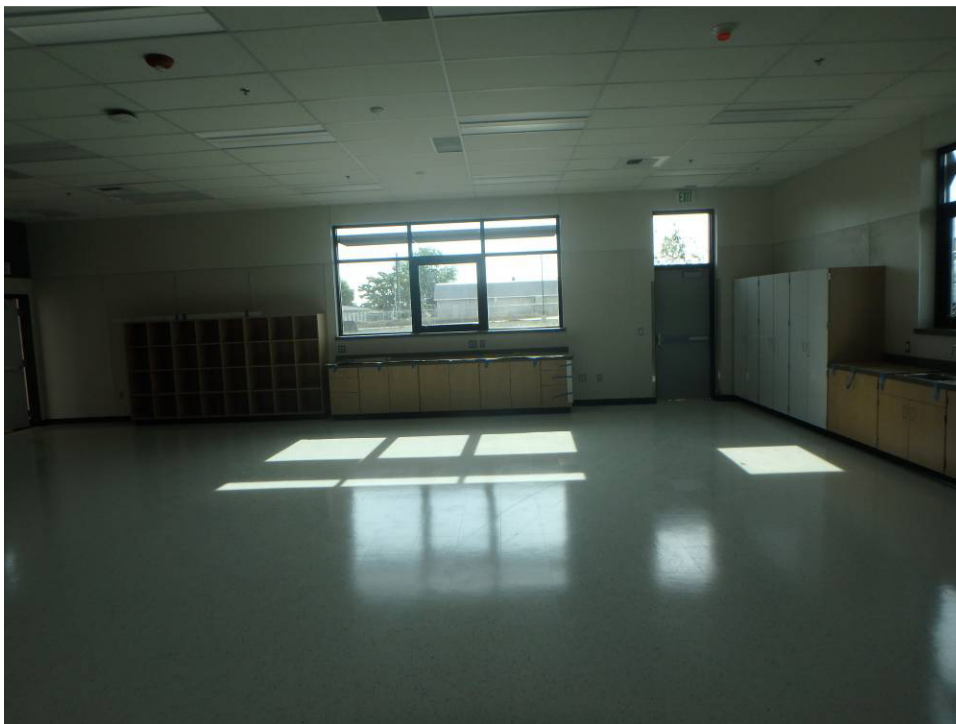
Looking at the casework on the east wall of the south classroom