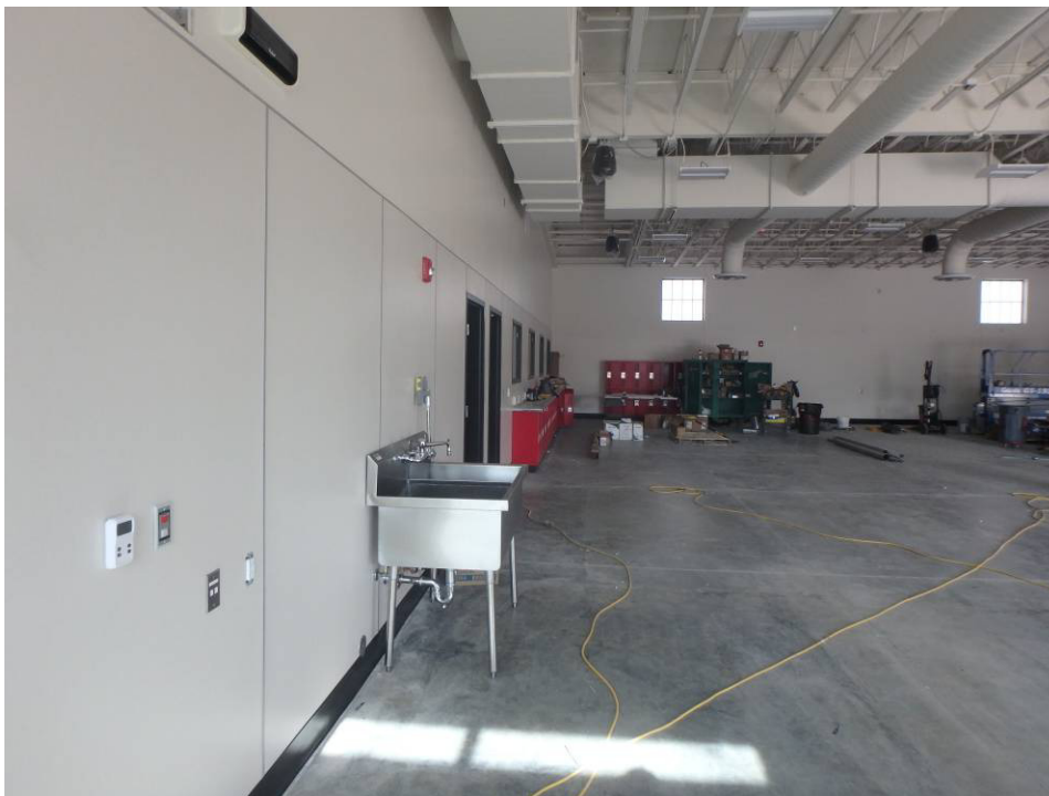
Looking west along the south wall of the shop