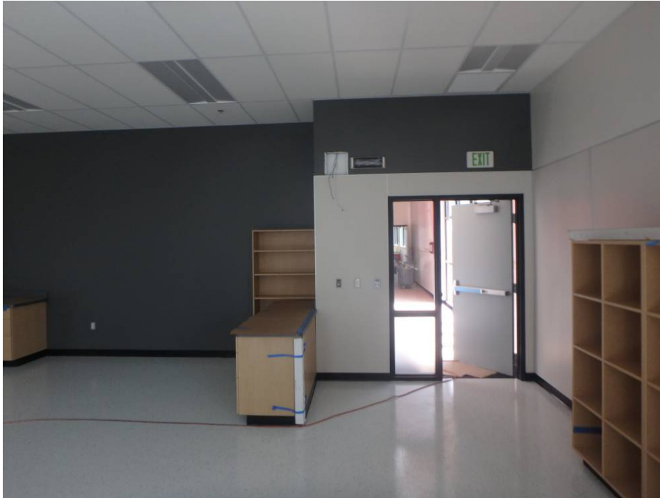
Looking north at the northeast corner of the south classroom