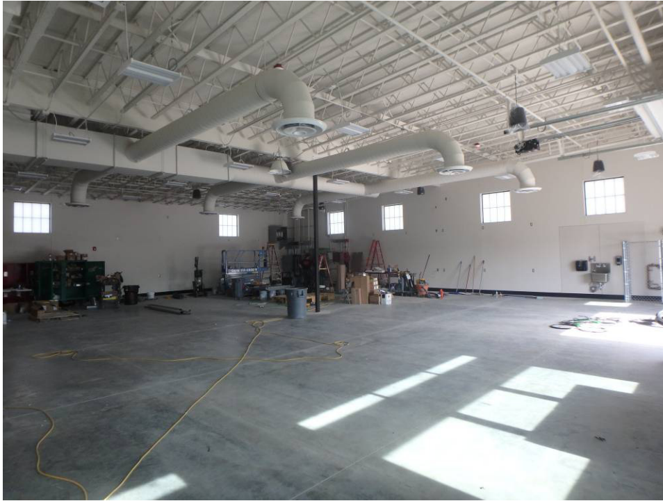
Looking northwest into the shops northwest corner