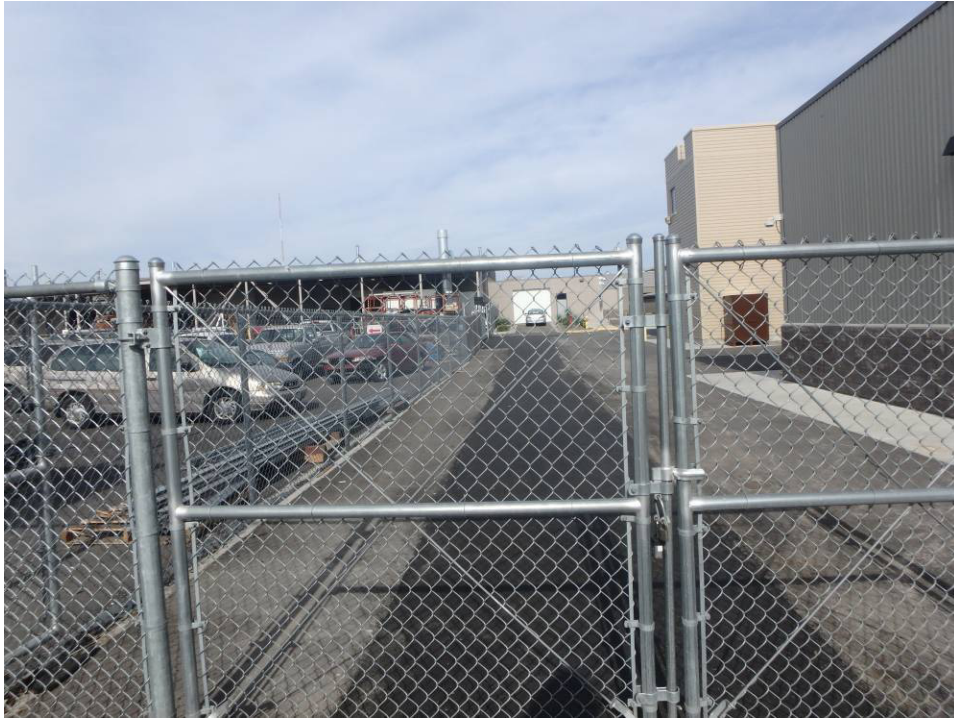
Alleyway – looking west