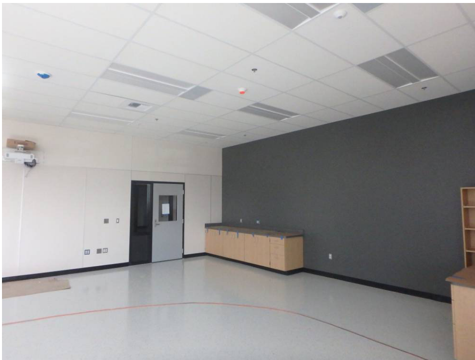
Looking northwest at the northwest corner of the south classroom