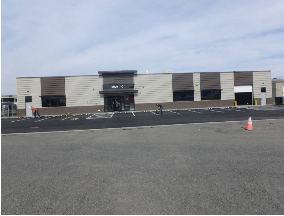
East building elevation