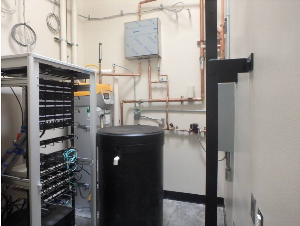
Mechanical room –preparing to sent water softener and brine tank