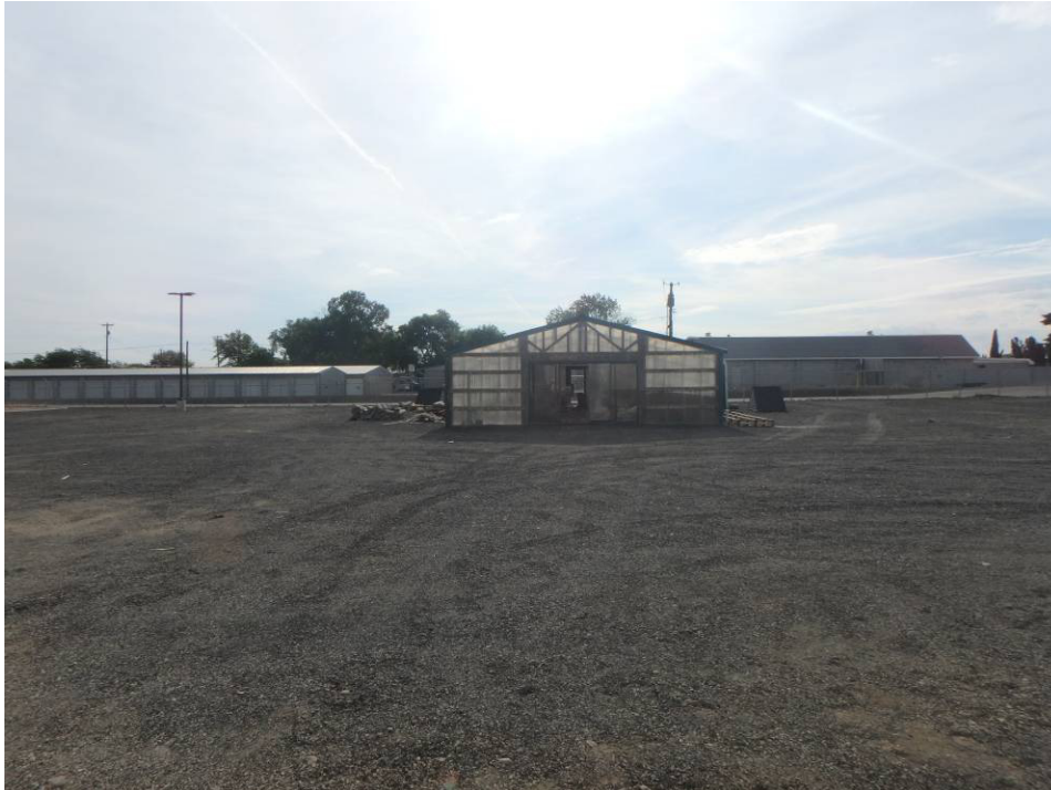
Looking northeast at the northeast corner of the site and the greenhouse