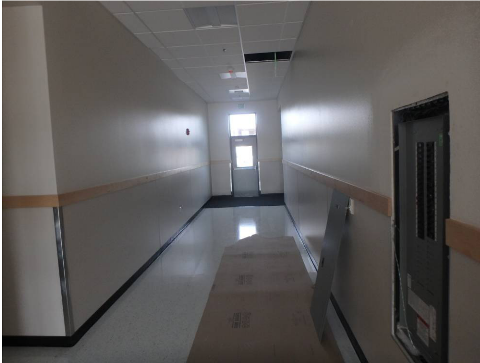
Looking west at the main east-west corridor