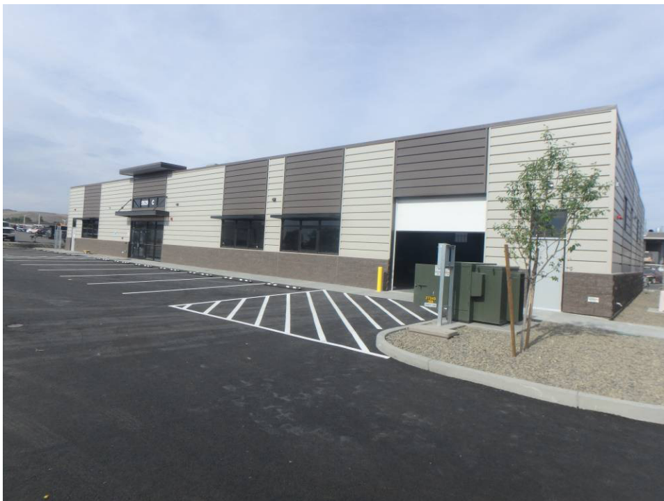
Looking southwest at the east elevation