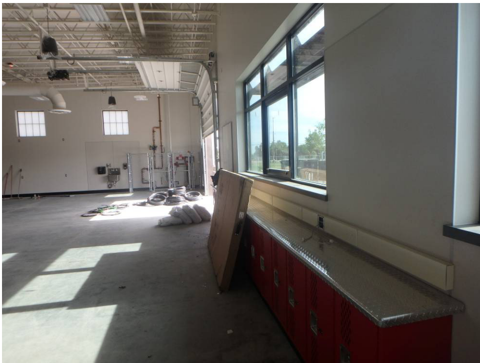
Looking north along the shop's east wall and lockers with diamond plate top