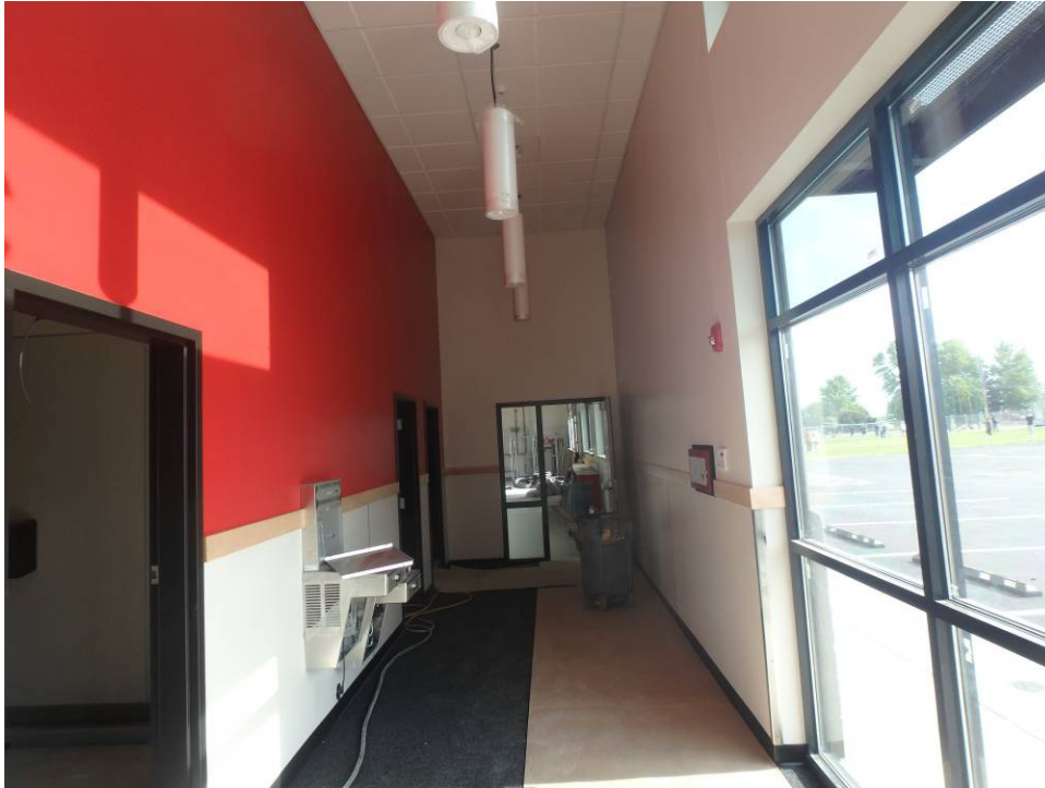
Entry – looking north