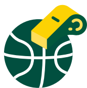
PHYSICAL EDUCATION .5 Credit