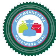
OHIO MEANS JOBS*