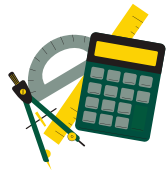
MATHEMATICS 4 Credits