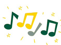
FINE ART 1 Credit