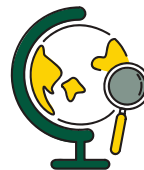
SOCIAL STUDIES 3 Credits