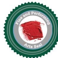
FINE & PERFORMING ARTS