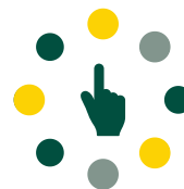
ELECTIVES 5.5 Credits