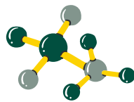
SCIENCE 3 Credits