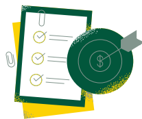
FINANCIAL LITERACY .5 Credit