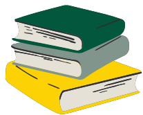
ENGLISH LANGUAGE ARTS 4 Credits