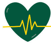
HEALTH .5 Credit